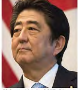
Shinzo Abe in 2017.

"After the fatal shooting of former Prime Minister Abe, the 'Asahi' newspaper [leftwing] stated in an editorial that Abe was 'advertising' the Unification Church. Those who oppose Abe have been trying to gear the