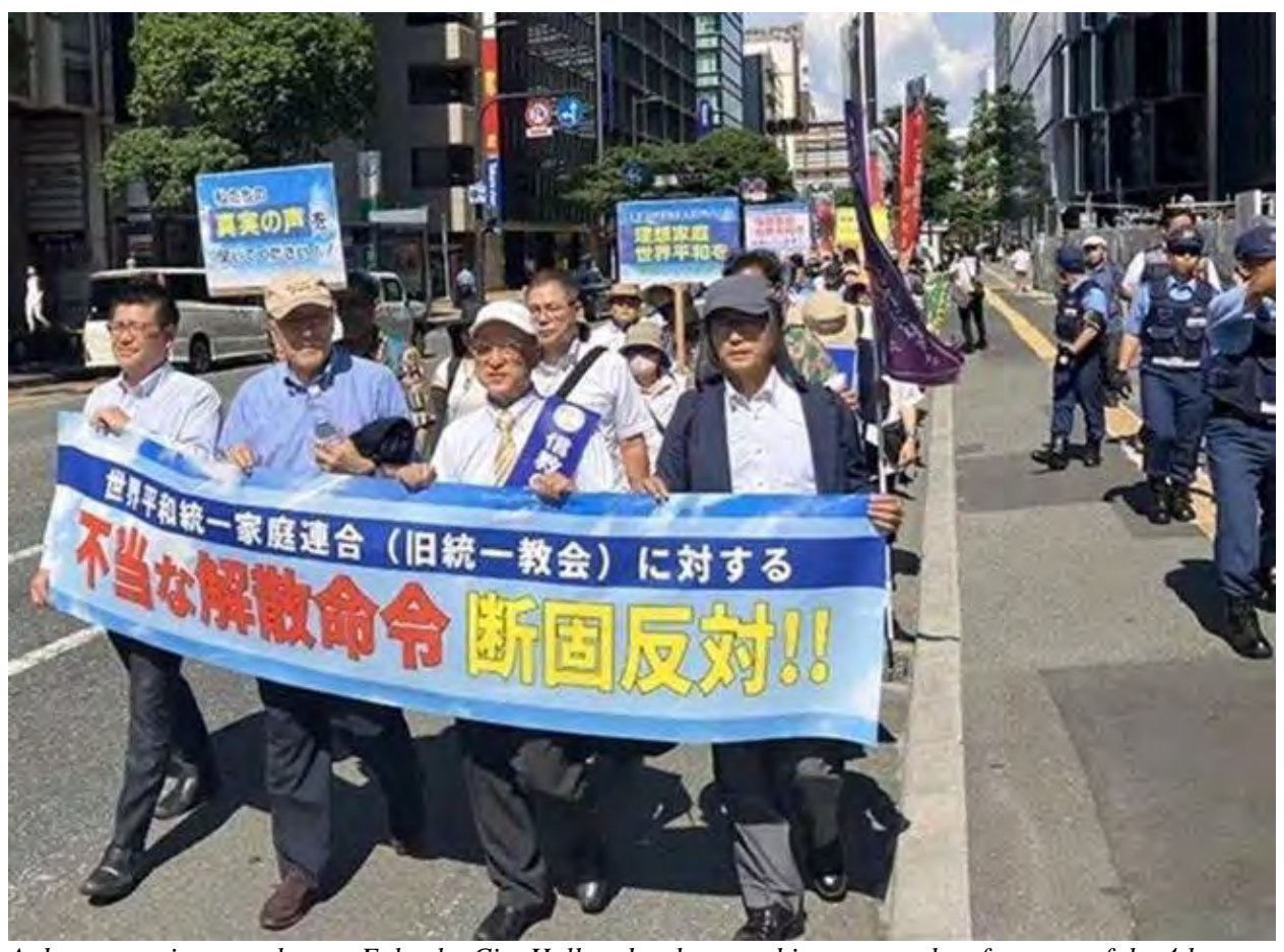
A demonstration march near Fukuoka City Hall under the scorching sun on the afternoon of the 4th August 2024, Fukuoka City, Fukuoka Prefecture