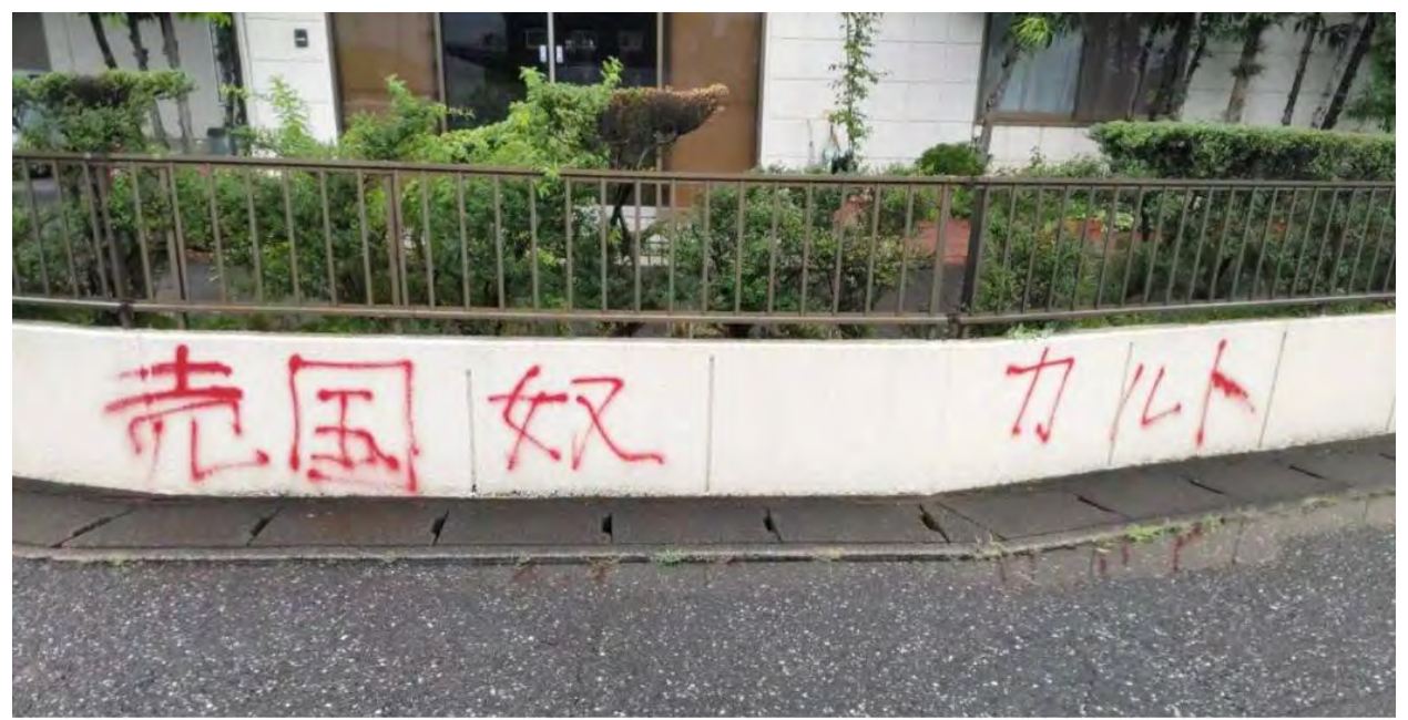
Graffiti damage at Ichinomiya Family Church