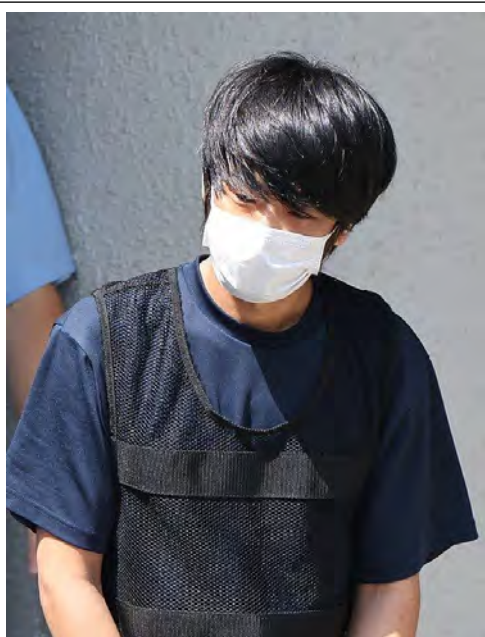
Committed heinous crime: Tetsuya Yamagami, the man who killed Shinzo Abe, the former prime minister of Japan and blamed it on the Unification Church

See 1st article , 2nd article , 3rd article , 4th article , 5th article , 6th article , 7th article , 8th article , 9th article , 10th article , 11th article , 12th article , 13th article , 14th article , 15th article , 16th article , 17th article , 18th article , 19th article , 20th article