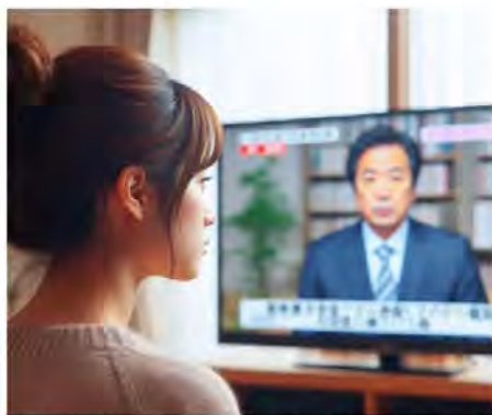
Influenced negatively by biased reporting. Illustration: Microsoft Designer Image Creator, 15th August 2024.

However, after the shooting incident involving former Prime Minister Abe, things changed dramatically. As media criticism of the church increased on TV and the internet, her relationship with Megumi began to become strained.