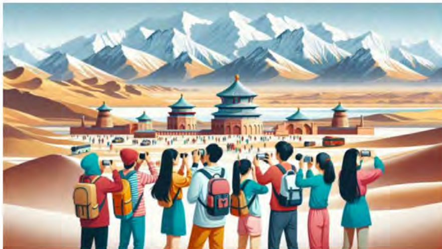
Naïve foreign tourists visiting Xinjiang. AI elaboration of Chinese propaganda posters.

and others on carefully curated tours of Xinjiang with Uyghurs who promote state talking points about life in the region and have been forced to deny their own torture and ill treatment at the risk of additional mistreatment."