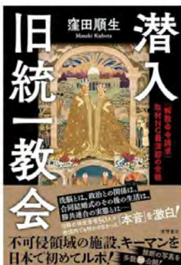
The front cover of 'Infiltrating the Former Unification Church' (潜入旧統一教会「解散命令請求」取材NG最深处の全貌-