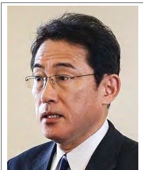
Fumio Kishida in 2015, during his time as minister for foreign affairs

The story could potentially be damaging for the Kishida administration. The allegations of "evidence destruction" involving a government official in a foreign country raise serious ethical and political concerns.