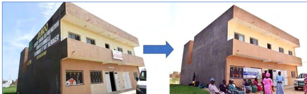
Jamoo2 Vocational School in Senegal, before and after the name and the WFWP logo were removed from the school building.