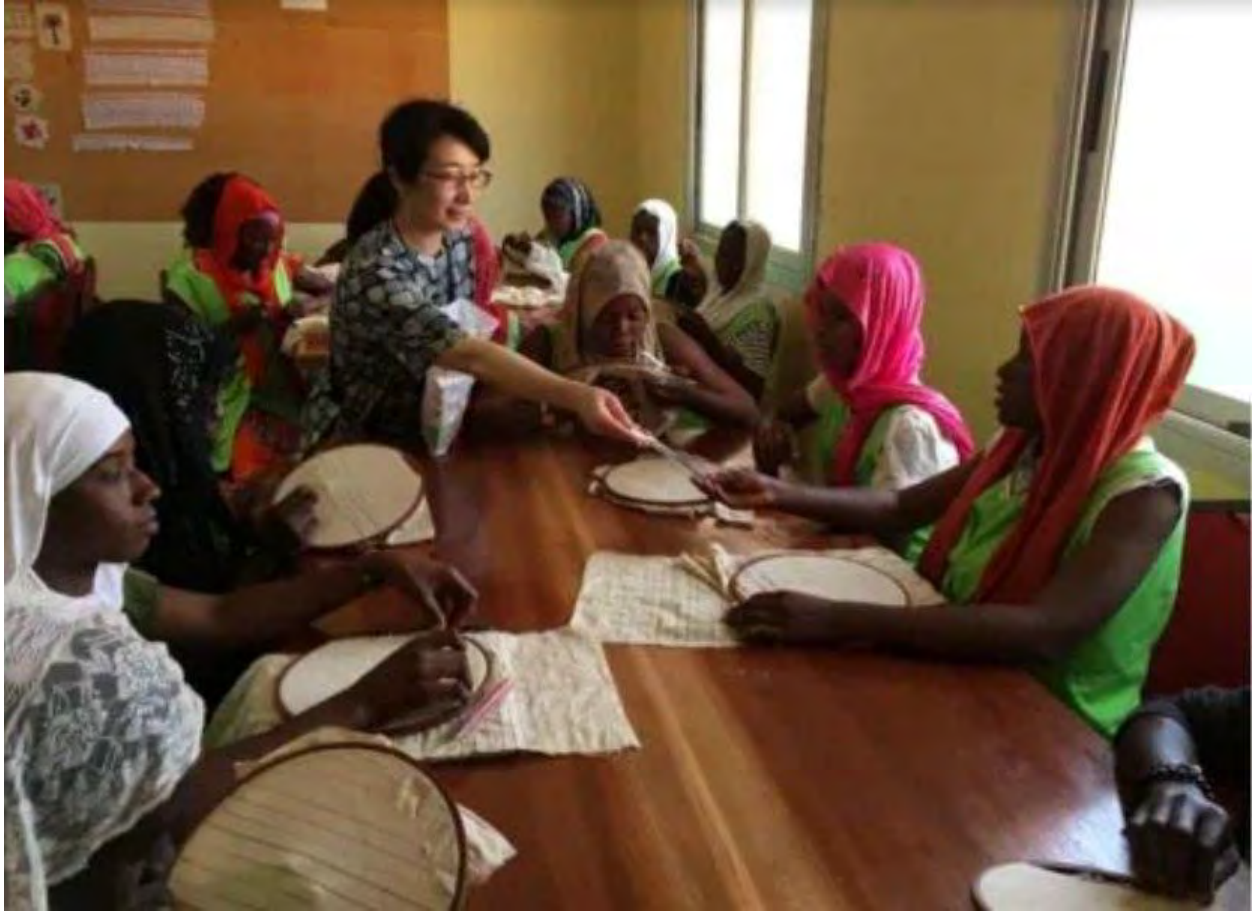
Jamoo2 vocational school