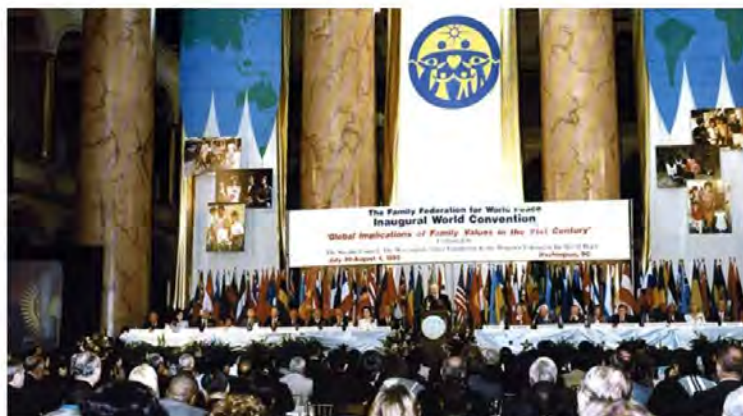
The Inaugural World Convention of the Family Federation 31st July 1996

"While the world's finest athletes test themselves in Atlanta, this gathering is sort of a spiritual Olympics. Like the Olympians, you have assembled from all over the world to further the cause of peace among nations.