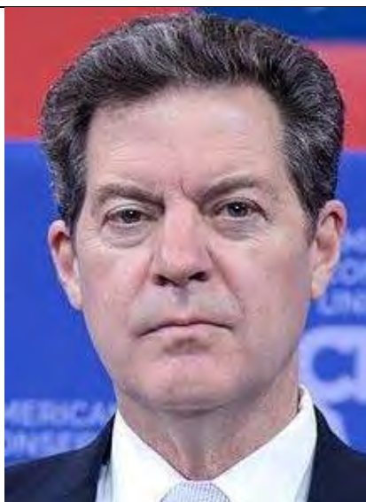
Sam Brownback. Photo (2015)