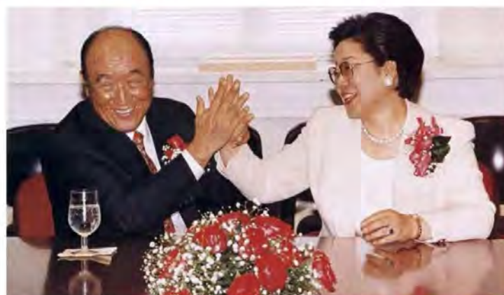
Father and Mother Moon 1st August 1996.