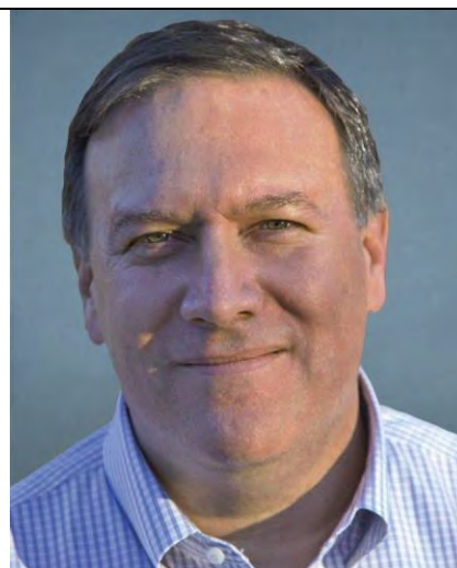
Mike Pompeo in 2013