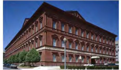
National Building Museum, Washington DC. Public domain image. Cropped