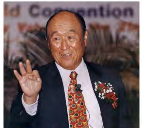
Sun Myung Moon 1st August 1996