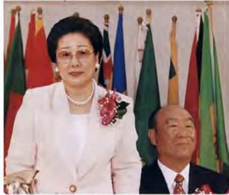
Mother and Father Moon 31st July 1996

The chronicle "40 Years in America" describes the event,