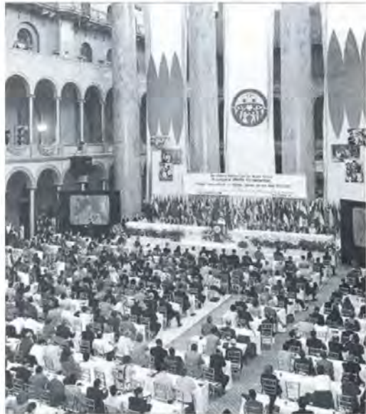
From the Inaugural Convention 31st July 1996.

'Religious organizations have always been centered upon the salvation of the individual, but we have now progressed to the salvation of the family. [...] Such an organization is not a church; it is the Family Federation for World Peace.'