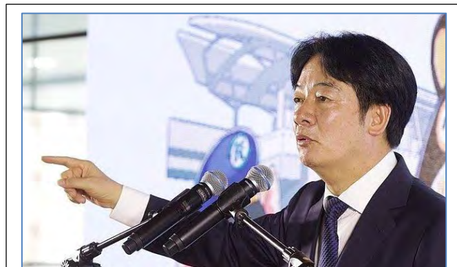
Lai Ching-te speaking in June 2024

That was a core message at the International Religious Freedom Summit Asia, held last month in Japan's capital city."