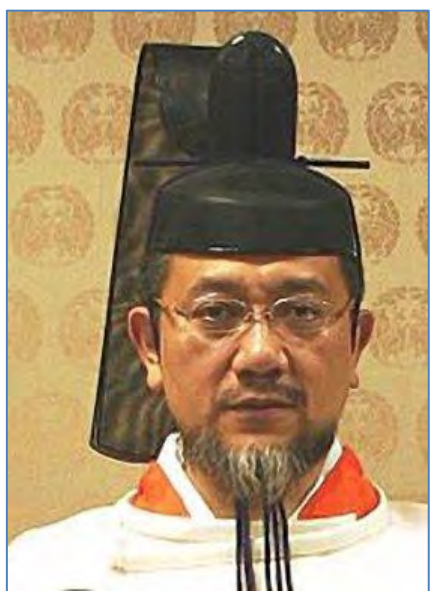
Yoshinobu Miyake. Photo (2015)

"Ties between the LDP and the church were torn apart in 2022 when Shinzo Abe, Japan's longest-serving postwar prime minister and a key LDP figure, was assassinated."