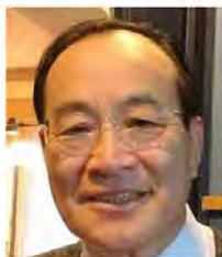
Hitoshi Hida (後藤 仁), member of the House of Representatives in Japan.

On the one hand, the U.S. State Department has addressed the issue of abduction and confinement of Unification Church believers in its International Religious Freedom Report and Country Reports on Human Rights Practices since 1999.