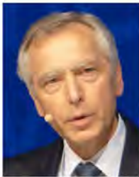
Jan Figel. Photo: Elekes Andor. License: CC ASA 4.0 Int