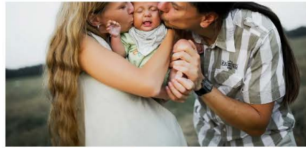
Parents kissing baby in Belarus August 2017.

that he wants to have children. Parents cannot be parents unless they have children. It is children who give their parents their title.