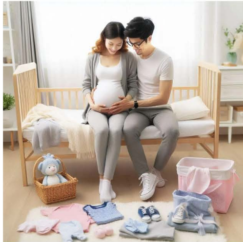
Preparing for the baby.

And he gave us a beautiful planet Earth and the whole universe as our home while we are alive.