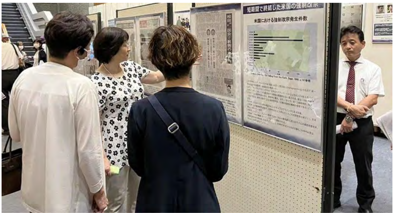
Participants receiving explanation of the panels on 29th September 2024, in Kumamoto City, Kyushu, Japan