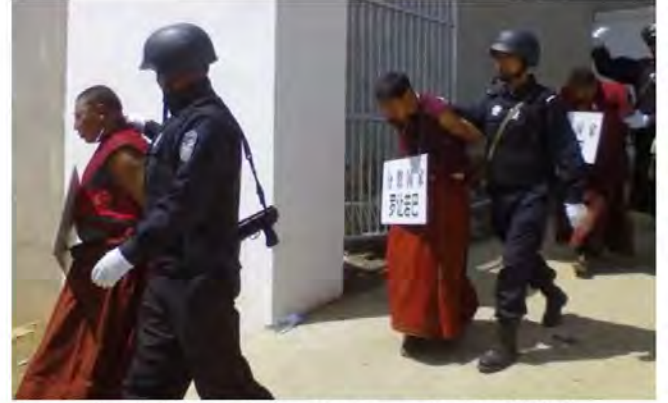
Persecution in China: Tibetan Monks arrested in 2008. Photo (5th April 2008): SFT HQ (Students for a Free Tibet) / Wikimedia Commons. License: CC Attr 2.0 Gen. Cropped

protest letter the 12 signatories state bluntly that a dissolution of the Family Federation will be a step similar to anti-religious measures used in nations like communist China and Putin's Russia, and that do not belong in a democratic country like Japan.