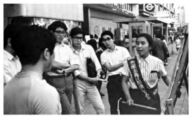
From a Victory over Communism campaign in Japan in 1969, supported by the Unification Church.

described how immediately after Abe had been murdered by a terrorist, "press conferences and an unprecedented media campaign of slander followed."