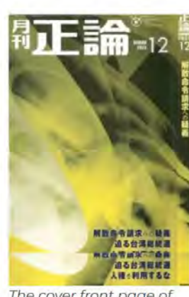
The cover front page of Monthly Seiron December 2023.

Bitter Winter published this part of the report of Seiron on 19<sup>th</sup> January