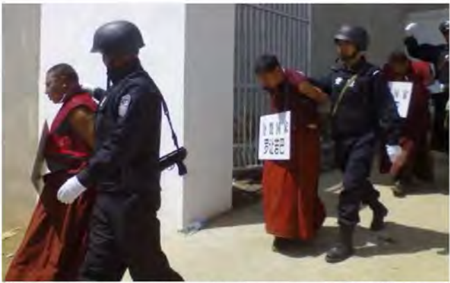
Persecution in China: Tibetan Monks arrested in 2008.

Introvigne emphasizes that the situation in Japan, where the government is seeking to dissolve the Unification Church without it having committed any criminal acts, is unique and unusual in a democratic country that upholds freedom of religion. He points out that the current events in Japan are being highlighted in Chinese and Russian media as a form of propaganda, drawing parallels between Japan's actions and those of China in suppressing religious groups. Introvigne explains how the situation in Japan is being used for propaganda purposes by China and Russia,