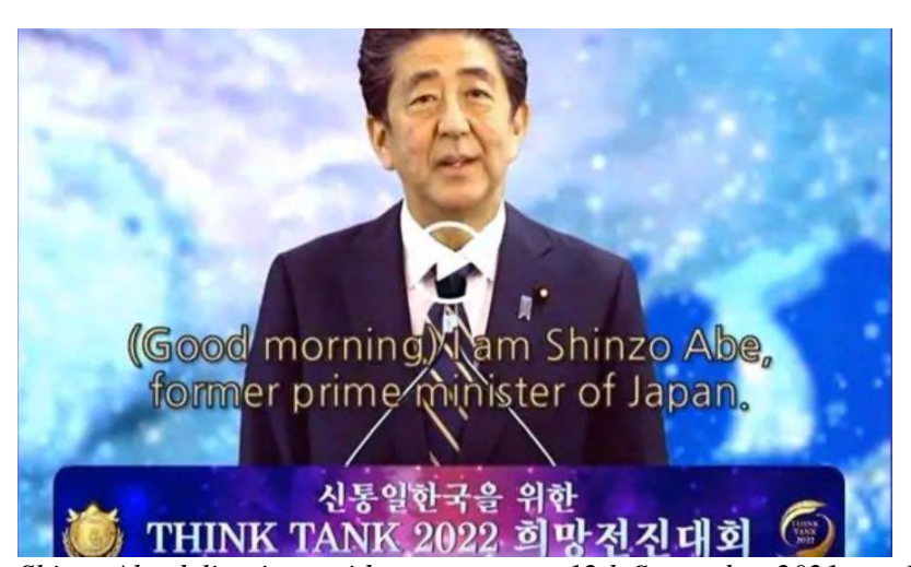
Shinzo Abe delivering a video message on 12th September 2021 at a UPF event

"I want to challenge the current situation where it seems acceptable to defame or publicly shame someone just because they are a member of the <u>Family Federation</u>."