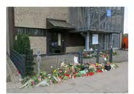
Kingdom Hall in Hamburg-Alsterdorf, ten days after the killing spree on 9th March 2023: damaged door, flowers and candles.

"Last March [2023] in Germany, a former member of the Jehovah's