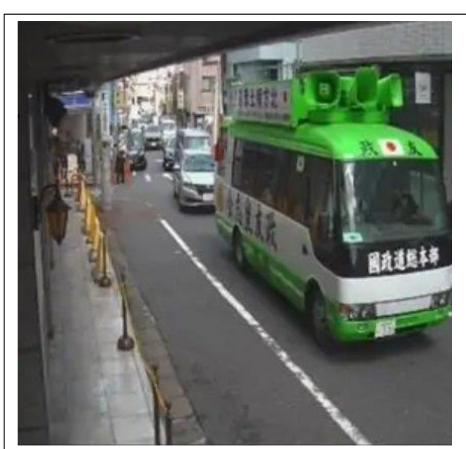
Japanese sound truck of the kind used to drive slowly past <u>Family Federation</u> properties while blasting out a hostile message

connections to movements hostile to the Unification Church and new religious movements in general.