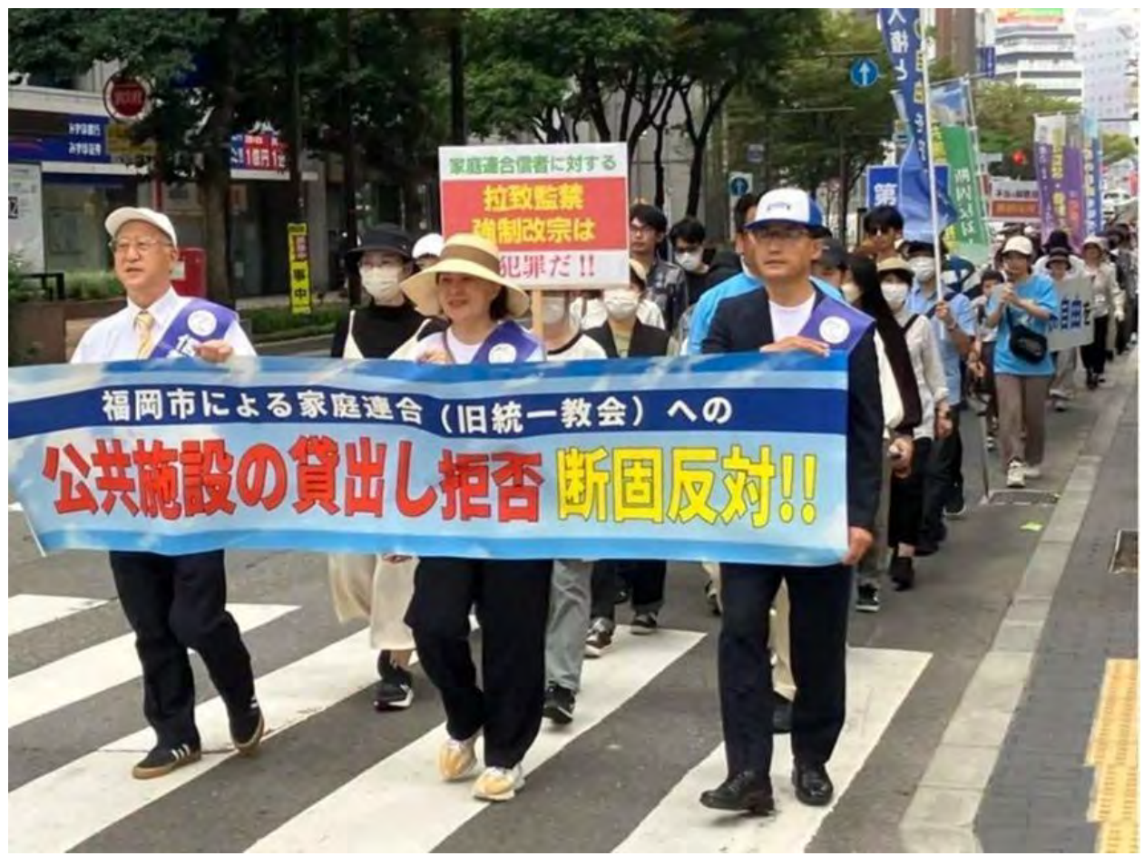
Participants in the demonstration that started in front of Fukuoka City Hall and marched through the downtown area of Fukuoka City, on the southern Japanese island of Kyushu on 6th October 2024