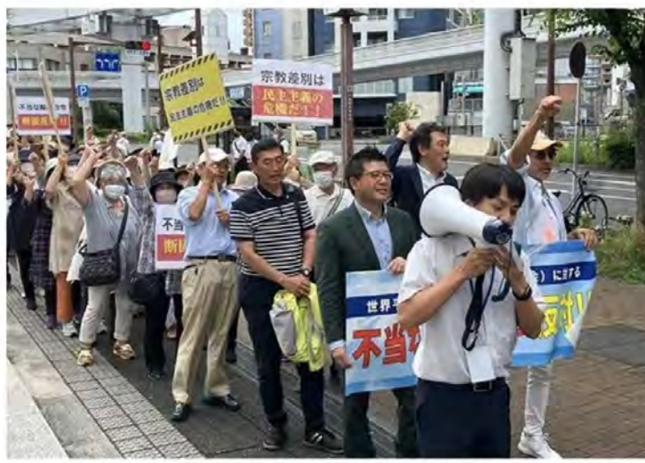
From the demo in Kitakyushu City 30th June 2024.

Prime Minister Shinzo Abe on 8<sup>th</sup> July, followers of the Family Federation for World Peace and Unification (formerly known as the Unification Church) held rallies and marches across the country, calling for freedom of religion.