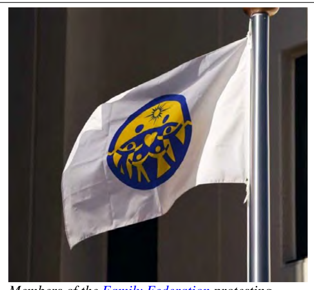
Members of the <u>Family Federation</u> protesting against the unjust dissolution of their movement. Here, the flag of the federation waving in Japan

On the afternoon of 6th October 2024, the "Fukuoka Citizens' Association for the Protection of Fundamental Human Rights and Freedom of Religion", organized by volunteers from the <u>Family Federation for World Peace</u> and <u>Unification</u> (formerly the <u>Unification</u> <u>Church</u>), held a demonstration march through the busy streets around Fukuoka City Hall. About 400 people participated in the demonstration.