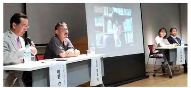
Discussions about faith experiences and social contributions were held at the 'Akita Rally to Protect Freedom of Religion' on 30th June 2024, in Akita City.

In Shinjuku Ward, Tokyo, on 30<sup>th</sup> June, about 100 followers held a protest march, claiming that the declaration by the Liberal Democratic Party to sever ties with the Family Federation was infringing on the followers' human rights. They chanted slogans such as "Protect freedom of religion".