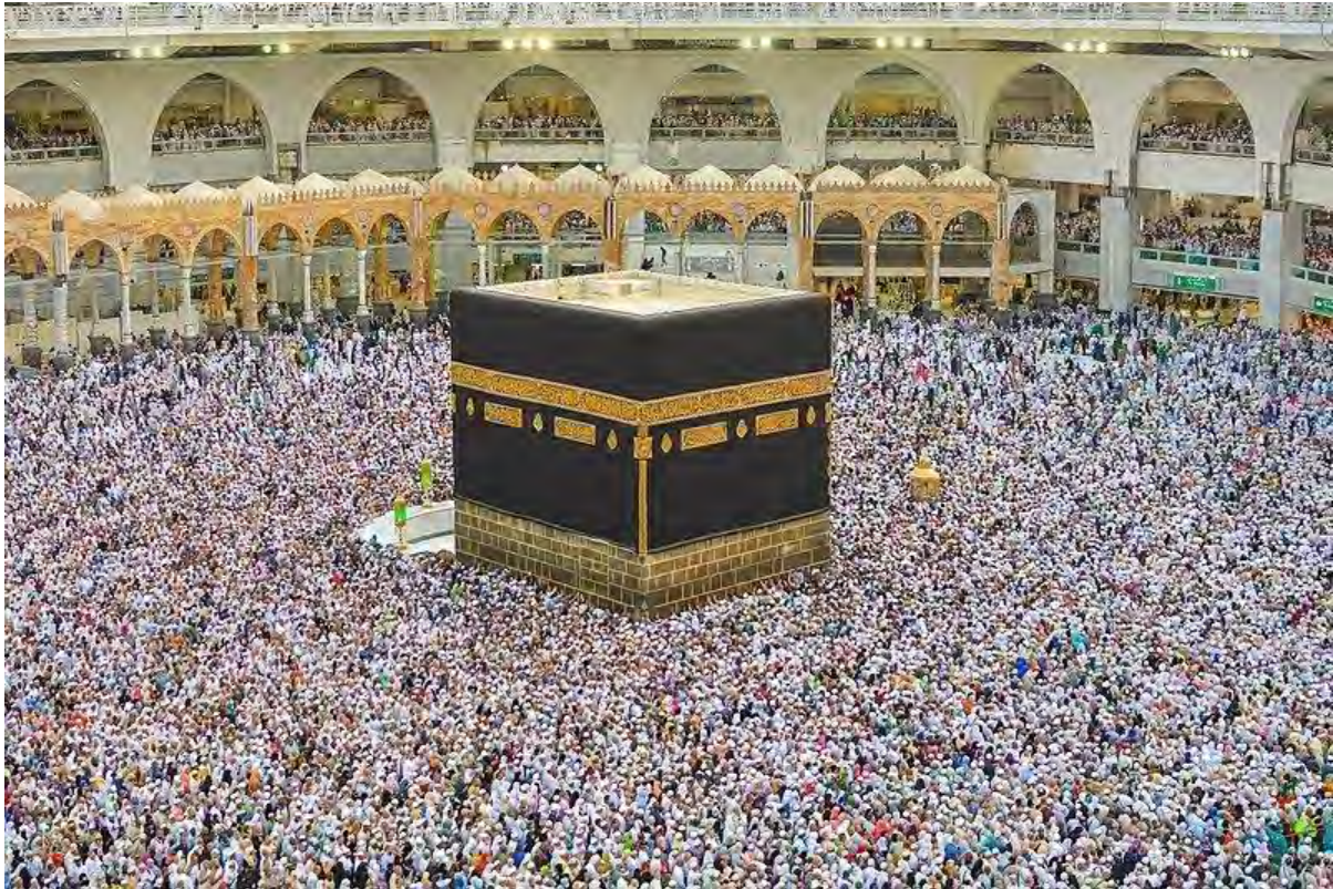
The Kaabah (Kaaba) is located in the Masjid Al-Haram in Makkah (Mecca, Saudi Arabia)

The second thing is attending the event. Mother is hoping that all of us will make the pilgrimage, like the hajj, to the Cheonwon Temple (Palace).