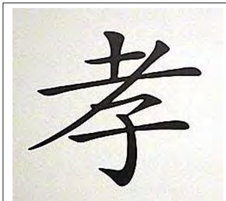
The Chinese character for hyo (filial piety)

"I understand you have a PhD from the seminary. That's not why I called you," she continued.