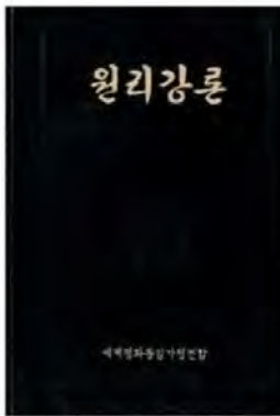
Wollli Kangron (pronounced Kangnon), literally "Discourse on the Principle(s)". Published in 1996 in English as "Exposition of the Divine Principle". It is the official version of Father Moon's earliest teachings, originally published in Korean in 1966. It is primarily written for a Christian audience.

But very tellingly, it also says it may be displeasing to believers that the truth they now have is not the whole truth. And we always used to think,