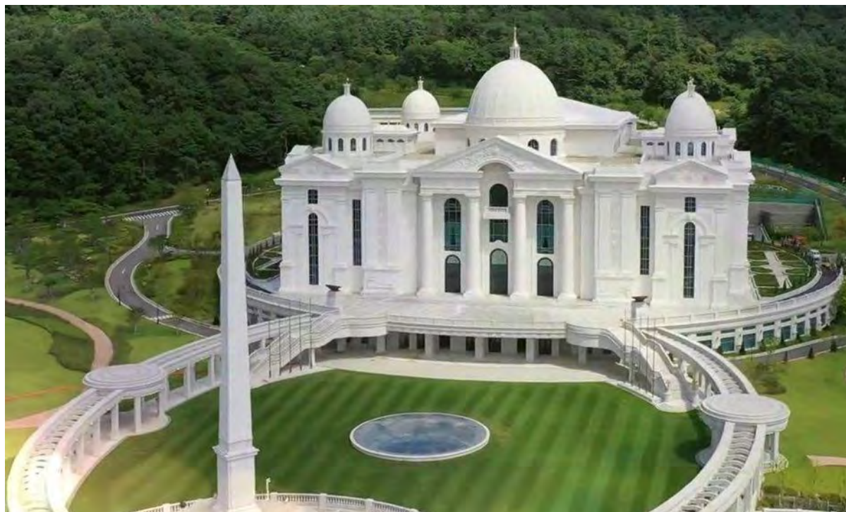
Cheonwon Temple (Palace) starting to take shape. Here, in August 2024

"Well, Mother , one thing that I don't notice, but I would like to see is something that honours the other religions and faiths. As I understand it, this is a place for all the people of the world to come and worship God in their own way and from their own tradition. And so far, I don't see much visually to encourage that kind of thinking. I was wondering if there couldn't be some sculpture or maybe a labyrinth or maybe the sayings of the saints?"