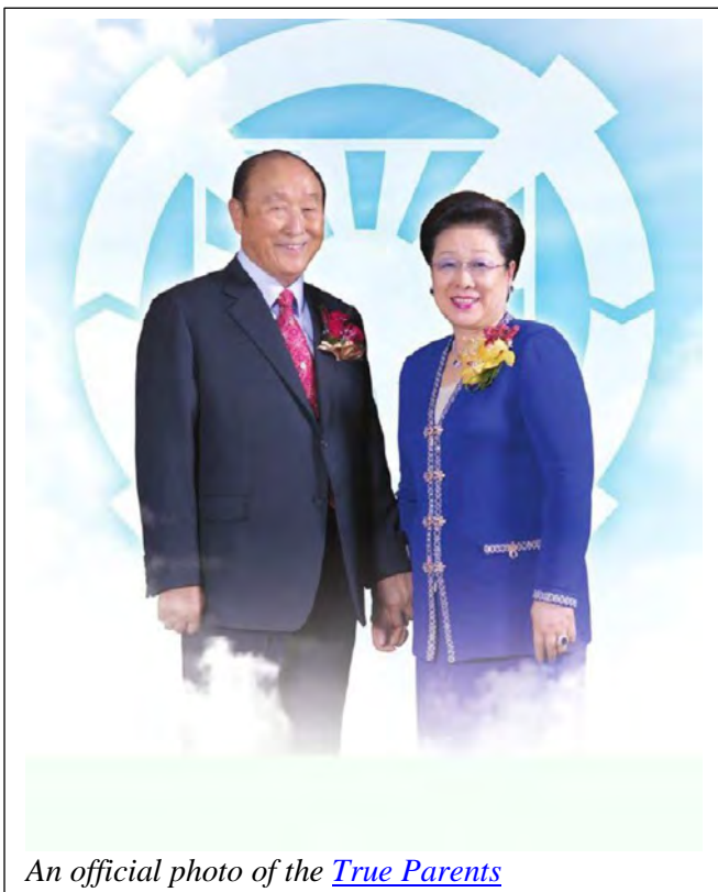
An official photo of the True Parents

"I do want to go there. I do want to pray in that sanctuary . I do want to see with my own eyes what True Mother has been building and appreciate it."