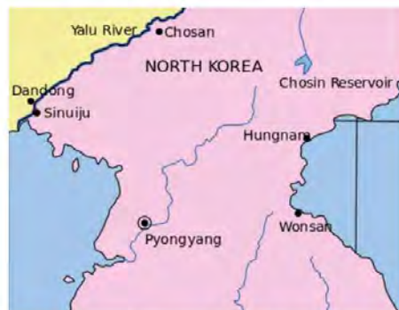
Part of North Korea with capital Pyongyang in the West and industrial city of Heungnam (Hungnam) on the East coast, the location of the death camp Sun Myung Moon was sent to by the communist authorities to have him suffer a slow death. Cropped

But anyway, [...] I think the key controversy among all these things is that the allegation that the Cham Pumo-ron teaches that Father made some serious errors in his lifetime, key among which was he didn't wait until he was 40 years old to marry True Mother . Another allegation is that those "mistakes" are the reason why Father had to go, for example, to Heungnam death camp , to Seodaemun prison, why he was tortured and suffered, not, as we have traditionally believed, to take on responsibility for the sins of humanity, but because of his own mistakes – rather than providential matters – that led him to do what he undeniably did, which was to endure torture, betrayal, beatings, imprisonment.