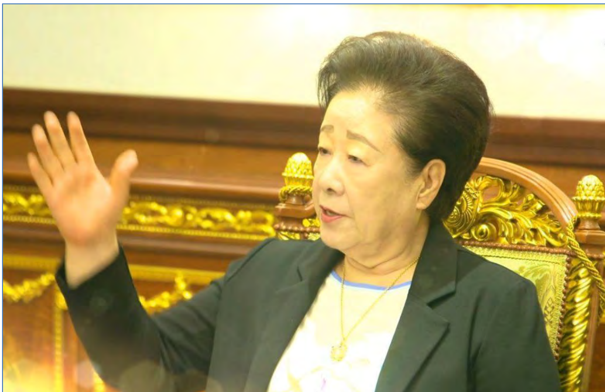
Mother Moon at an international leaders' meeting in Gapyeong, South Korea 6th September 2024