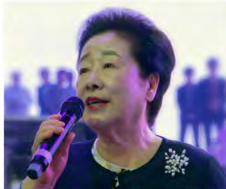
Mother Moon speaking in Munich, Germany 19th May 2024.

The second takeaway is that it's through True Mother, the daughter of God, that we can most fully understand the Heavenly Mother . True Mother, because she's a woman, and a very special woman, is able to explain this characteristic of God better than Father ever could, because Father's a man. Father never gave birth to any children, never experienced the pain of childbirth or miscarriage or any of those things that women endure.