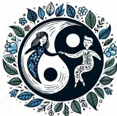
Female and male as yin and yang. AI illustration generated by Microsoft Designer Image Creator, 4th June 2024.

That's not new, but when I think about it myself even now, I catch myself saying "Heavenly Father, Heavenly Father" all the time, in prayer and everything. And it's taken a real effort to start thinking God is also a Mother, as well as a Father, and yet one .