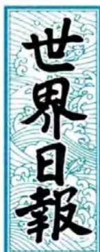
Logo of the Sekai Nippo

Leaders from Family Federation and 17 other faiths gathered in city of Niigata sending protest to regime Of Kishida