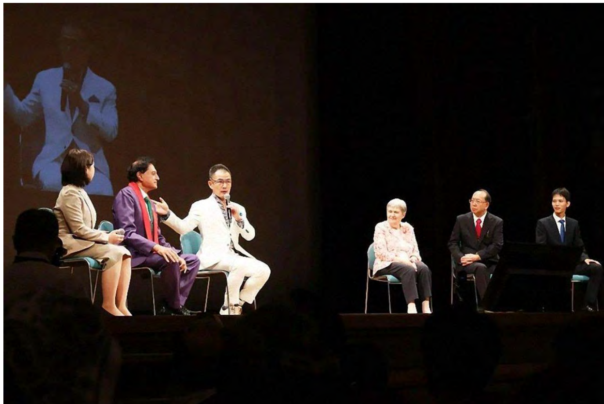
Speakers discussing the importance of faith - October 14, 2024, Osaka Public Hall, Chuo Ward, Osaka City