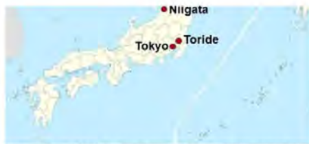
Location of the cities mentioned. Illustration: Maximilian Dörrbecker (Chumhwa) / Wikimedia Commons. License: CC ASA 3.0 Unp

Association to Protect Religious Freedom. The event was in response to the request by the Ministry of Education, Culture, Sports, Science and Technology to the Tokyo District Court for an order to dissolve the Family Federation for World Peace and Unification (formerly the Unification Church ). The theme for the symposium was "Citizens' Meeting for Niigata Prefecture to Protect Religious Freedom and Human Rights".