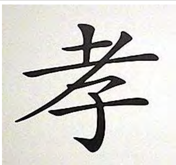
The Chinese character for hyo (filial piety). In the character a son, 子 (Korean ja ), carries an old man, 老 (Korean no ), on his back

Third, the "Epic of the Koreans as a Chosen People" visually expresses to humanity the history of Heaven's chosen people through culture and arts, such as paintings. It conveys the spirit and life of the Korean people centered on Heaven.