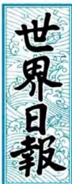
Logo of the Sekai Nippo

Challenging negative media narrative on 2nd-generation faith: A young Japanese lady tells her story, how she of her own free will chose her faith.