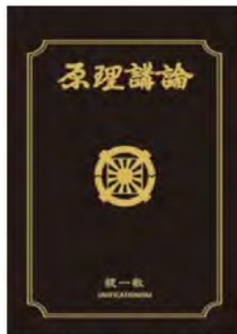
Front cover page of one version of Unification Principles in Japanese – 原理講論

"At home, I often clashed with my parents, and there were even times when I threw away food right in front of them."