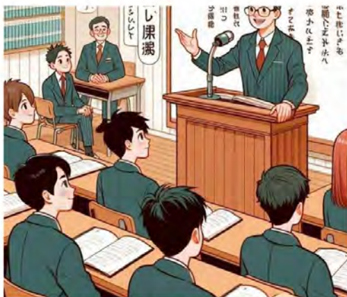
Studying the teachings.