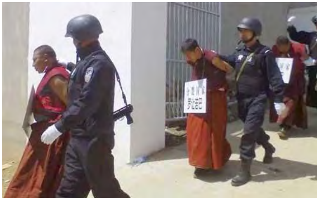
Tibetan Monks arrested in Communist China 5th April 2008