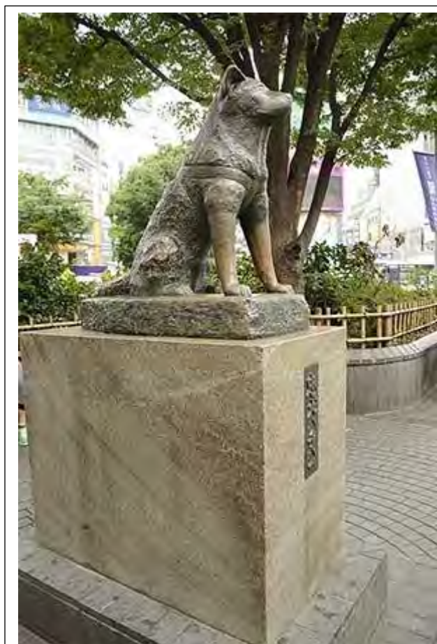
Hachiko, the Loyal Dog at Shibuya station, Tokyo

Previously, at gatherings in Nagasaki and other places, I have mentioned that demonstrations are a citizen's right. Given the current situation with the Family Federation, I believe we should raise our voices in a noticeable way.