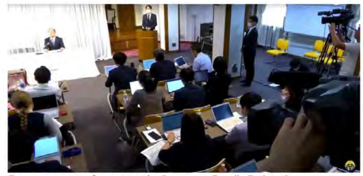
From a press conference at the Japanese Family Federation headquarters in Shibuya, Tokyo 16th Oct. 2023.

See part 5: The Distorted Image of the "Second-Generation": 29th article, 30th article, 31st article, 32nd article, 34th article