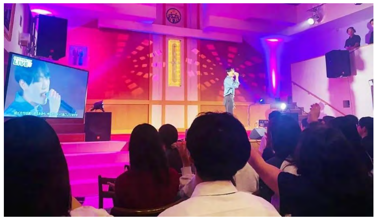
Live recording of Seisyun TV, a musical performance was also held on 29th September 2024 in Tokyo.