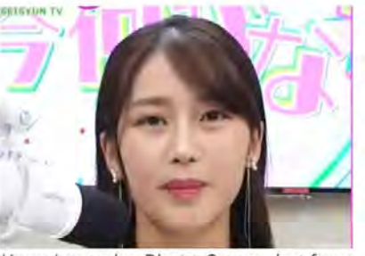
something you practice with suffering. If it is painful, we want to create a space to share that experience with others."