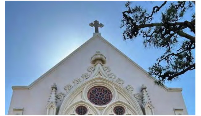
Part of the Catholic Shukugawa Church in Nishinomiya, Hyogo Prefecture, where Shusaku Endo was baptized