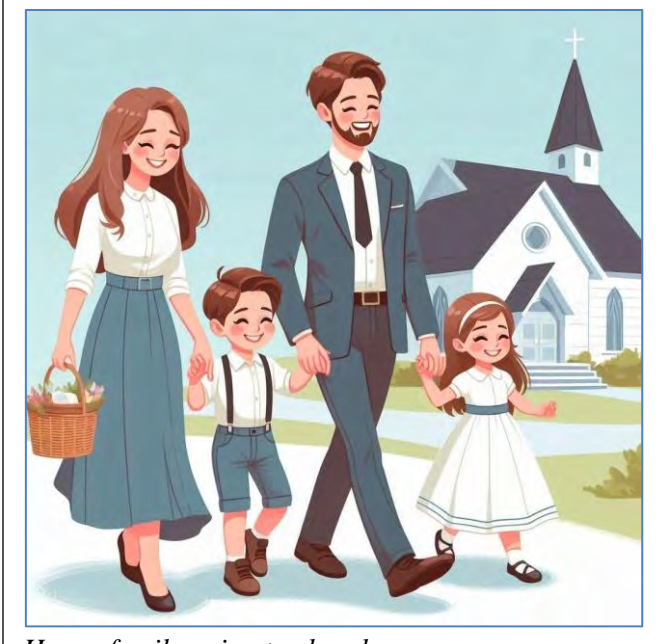
Happy family going to church

See part 5: The Distorted Image of the "Second-Generation": <u>29th article</u>, <u>30th article</u>, <u>31st article</u>, <u>32nd article</u>, <u>34th article</u>