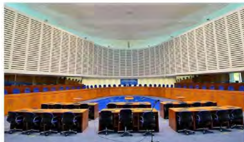
Courtroom of the European Court of Human Rights in Strasbourg.

Japan's reliance on these unproven claims aligns it with certain authoritarian governments, like Russia, which have taken steps to restrict minority religious groups under similar arguments. The European Court of Human Rights (ECHR) examined a similar issue in