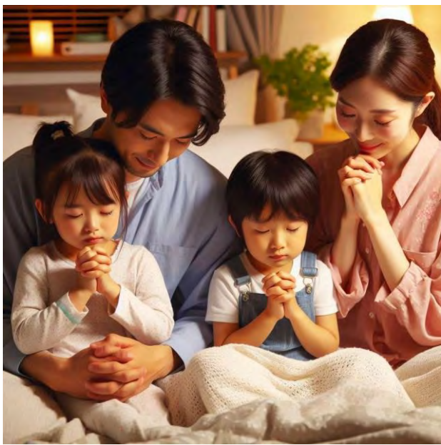
Praying together before bed

On the day of the entrance ceremony at the Cheonwon Temple (Palace), the True Parents will remove the deep night that has separated our Heavenly Parent from humankind, opening a radiant era of glory and hope.