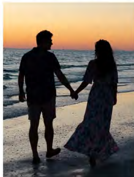
Cropped

The next season of the heart is the experience of conjugal love. It is the horizontal love shared exclusively with a person of the opposite sex, within the bond of marriage. This is the only form of love which includes sexual relationships. Sex is given a paramount importance in our culture, but human sexuality without true love has a bitter taste, and leaves people with various traumas. The physical traumas and risks of casual sex for health are almost benign, compared to the psychological effects.