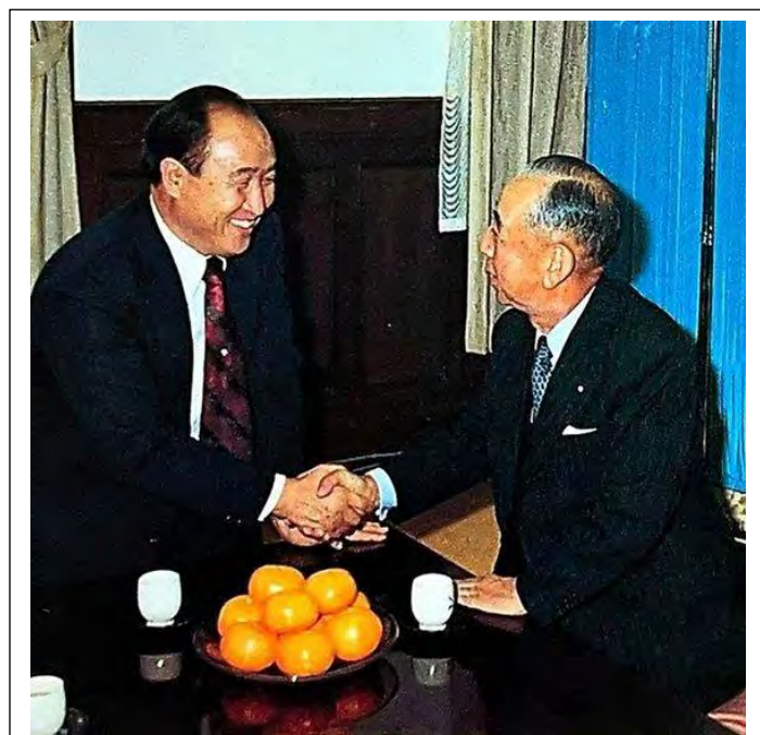
Sun Myung Moon and Nobusuke Kishi, Prime Minister of Japan 1957-1960, shaking hands in Tokyo

"the public has been misled into accepting the narrative that 'Prime Minister Abe was assassinated because the Unification Church was evil'."