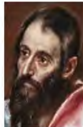
Saint Paul (ca. 10-67 AD), one of the apostles of the early church and author of several letters in the New Testament. From painting by El Greco, from Saint Louis Art Museum, Missouri, USA. Public domain image

"So I find this law at work: although I want to do good, evil is right there with me. For in my inner being I delight in God's law; but I see another law at work in me, waging war against the law of my mind and making me a prisoner of the law of sin at work within me. What a wretched man I am! Who will rescue me from this body that is subject to death?" (NIV)