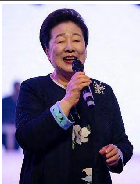
Mother Moon speaking in Munich, Germany 19th May 2024

You may have heard so much about it that you don't want to hear anymore, but the bad news is you're going to hear about it one more time today.