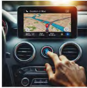
Guided by GPS.

Most people will turn on their GPS, press their destination, and find out how to get there. In this way, when searching for directions, we set a starting point and a destination.