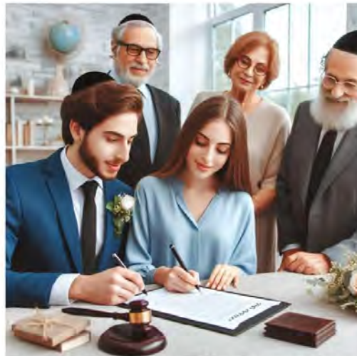
Marriage contract being signed by young Jewish couple.

But then if they agreed and signed the contract, what would happen is that the bride would go back to her parents, and the bridegroom would go to get ready. It was not just to change his suit, but to get a house, to prepare everything so that he could welcome his new bride.