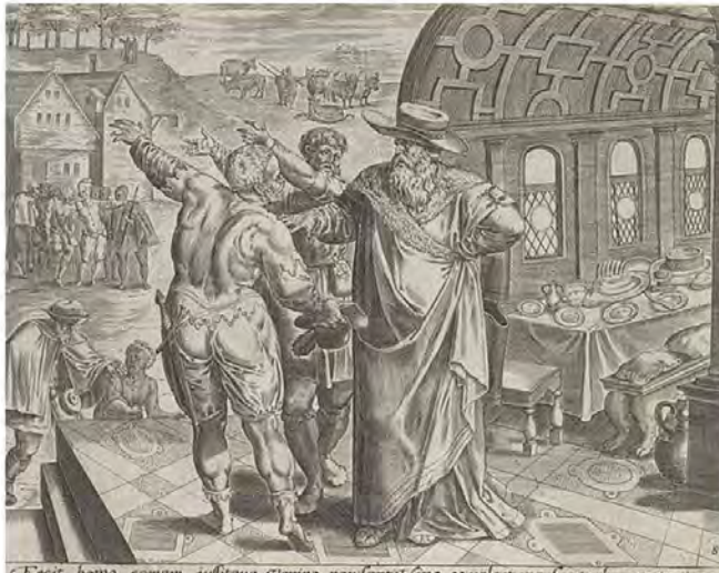
Fecit homo caenam iustique venire, recusant. tunc compleri mensas turba coacta est. Parable of the wedding feast. Illustration: Rijksmuseum, Amsterdam, Netherlands. Public domain image. Cropped

want to share with you two parables that Jesus spoke about, explaining about marriage feasts. And it's interesting that Jesus chose a marriage as the metaphor or illustration of what it's like to be invited to the Kingdom of Heaven . Jesus wanted people to think of it in terms they understood, right?