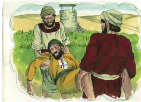
The messengers were beaten up. Image: Biblical illustration of Gospel of Luke. Distant Shores Media/Sweet Publishing. License: CC ASA 3.0 Unp

But they don't. In fact, not only do they not; they go off, one to his field, another to his business, and the rest actually seized the messengers and beat them up.