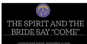
Illustration 24th Nov. 2024. Screenshot