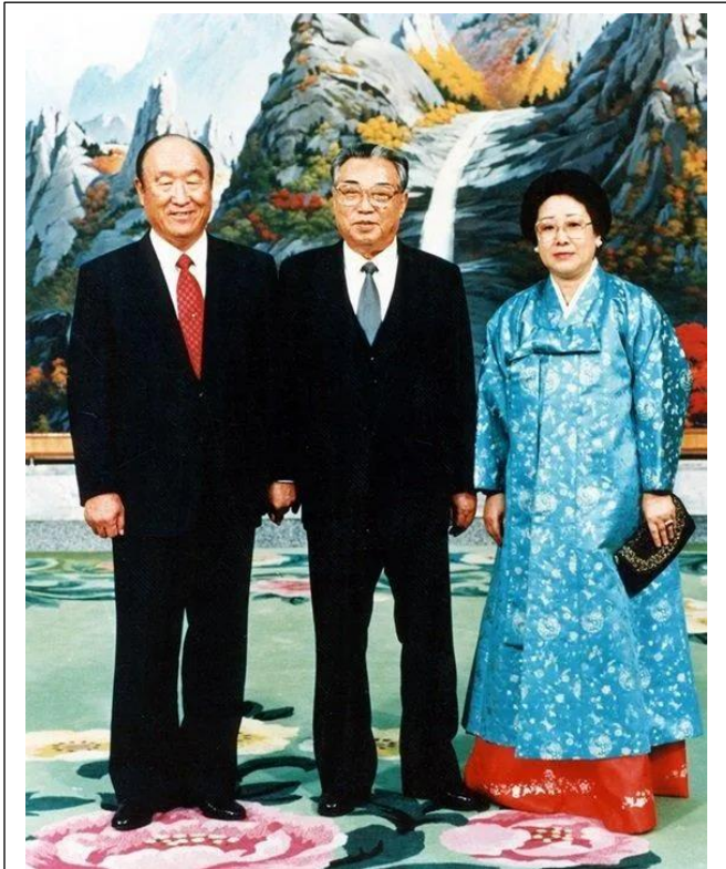
Father and Mother Moon with Kim Il-sung in Hungnam, North Korea Dec. 6, 1991

Now that has not changed and it's something that we can all unite around without fear.