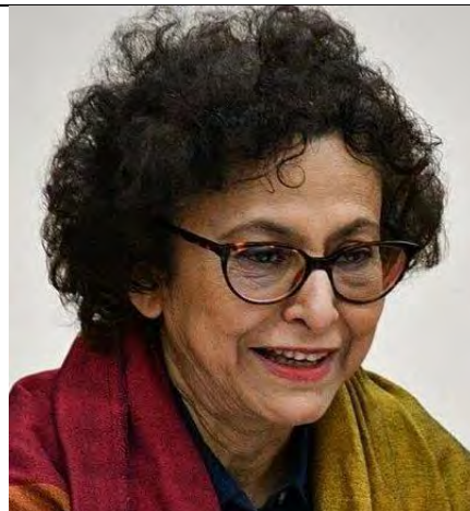
UN Special Rapporteur: Irene Khan 2024