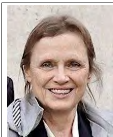
Patricia Duval, French attorney and expert on international human rights law. She has defended the rights of minorities of religion in domestic and international fora, and before institutions such as the European Court of Human Rights, the Council of Europe, the Organization for Security and Co-operation in Europe, the European Union, and the United Nations. She has also published numerous scholarly articles on freedom of religion or belief

The Japanese government has since implemented regulations that the UN officials argue may violate principles of neutrality and non-discrimination, while also stigmatizing religious minorities. Critics have pointed out that so-called "anti-cult" activists, known for their hostility toward these groups, were involved in drafting the regulations.