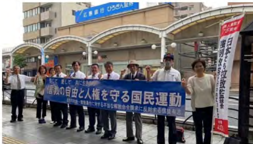
Members of the Unification Church/Family Federation protesting against the violation of their rights in Yamaguchi, July 2024.