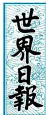
Logo of the Sekai Nippo