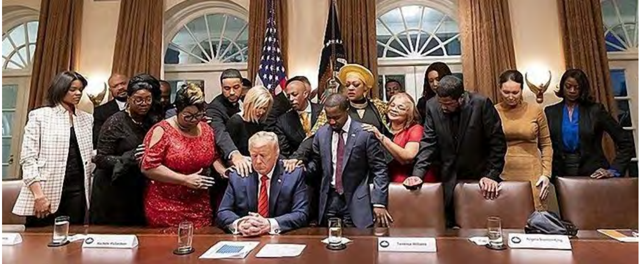
President Donald J. Trump participates in a prayer with African American Leaders and Pastor Paula White Thursday, Feb. 27, 2020, in the Cabinet Room of the White House

In late October 2024, just days before the U.S. presidential election, a gathering in the Atlanta suburbs of the key battleground state of Georgia attracted over 1,000 Christian pastors supporting Republican candidate and former President Donald Trump.