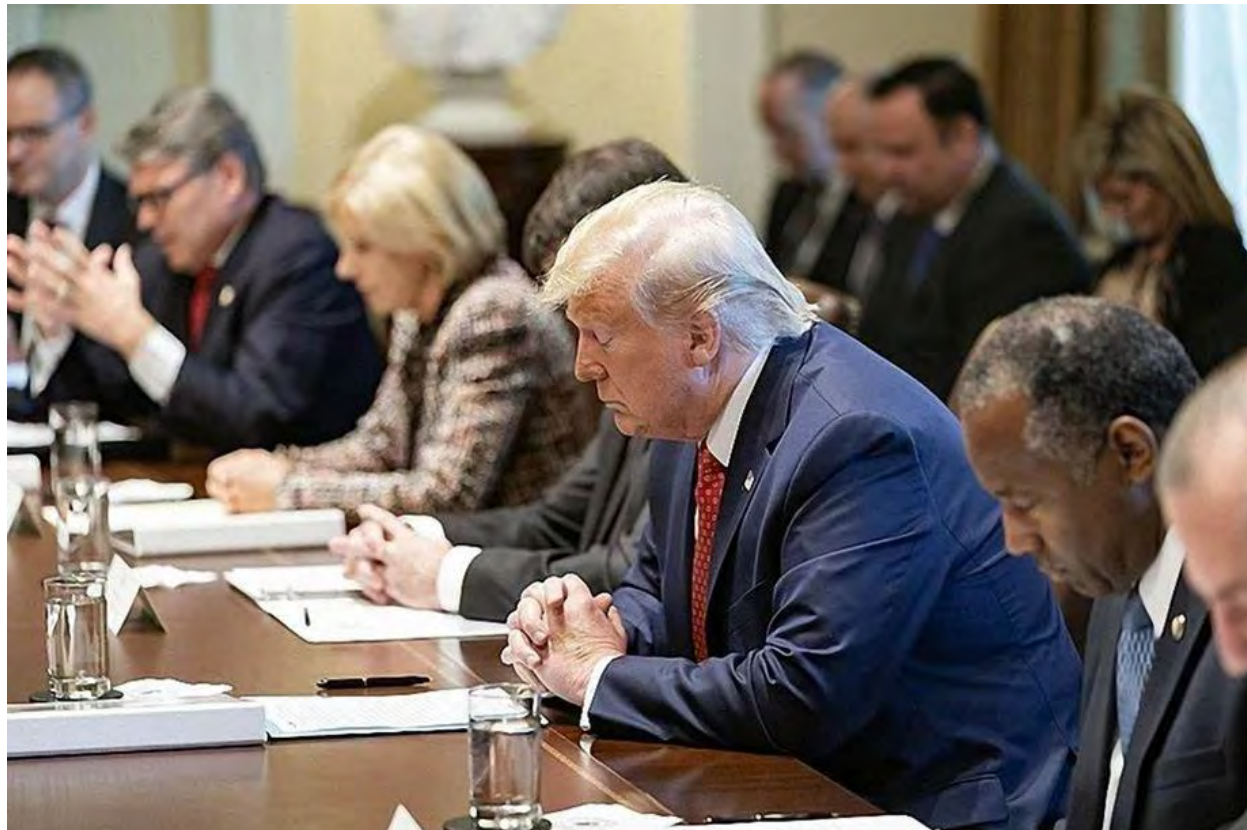
President Donald J. Trump joins members of his Cabinet in a prayer led by Secretary of Energy Rick Perry during a Cabinet Meeting Tuesday, Nov. 19, 2019, in the Cabinet Room of the White House