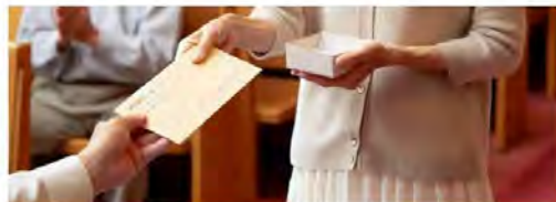
A Japanese woman offering a donation at a meeting.

person's financial situation. We repeatedly gave guidance on these points and insisted on transparency in evangelism by identifying the organization from the outset. As a result, the number of lawsuits dropped significantly.