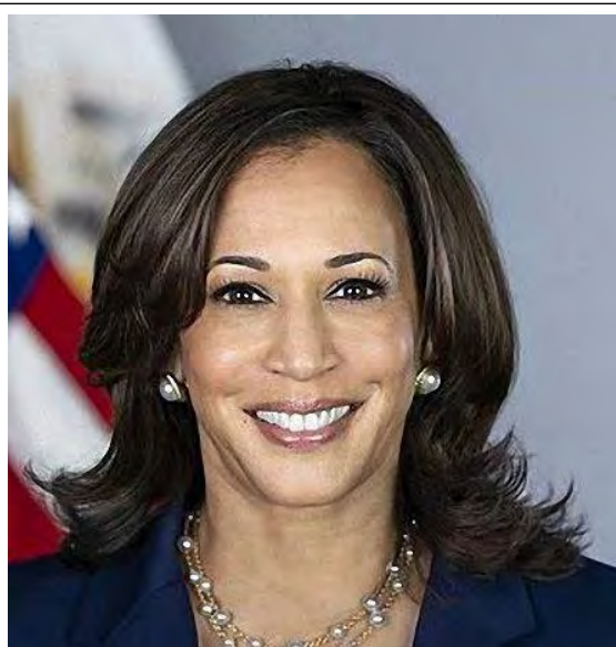
Vice President Kamala Harris takes her official portrait Thursday, March 4, 2021, in the South Court Auditorium in the Eisenhower Executive Office Building at the White House

In contrast, Japan's reaction to the intersection of religion and politics is starkly different. Following the assassination of former Prime Minister Shinzo Abe, public attention turned to the ties between the Liberal Democratic Party (LDP) and the Family Federation for World Peace and Unification (formerly the Unification Church ). This led to widespread condemnation, and the LDP announced a complete severance of ties with the organization . The backlash created a social climate in which any religious involvement in politics seemed taboo, as though religion must have no place in political matters whatsoever.