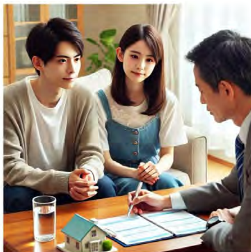
Family counselor with young couple.

A: There are likely various areas where people have been hurt, and we may not fully understand what the best form of mental health care is. However, we must do what we can. One initiative the organization undertook, albeit belatedly after this incident [ Editor's note: the assassination of former Prime Minister Shinzo Abe (安倍晋三) in July 2022 ], is the establishment of "Certified Family Counselors". Around 1,450 individuals have registered after completing organizational training, and we have created a system where members can request consultations through a dedicated app.