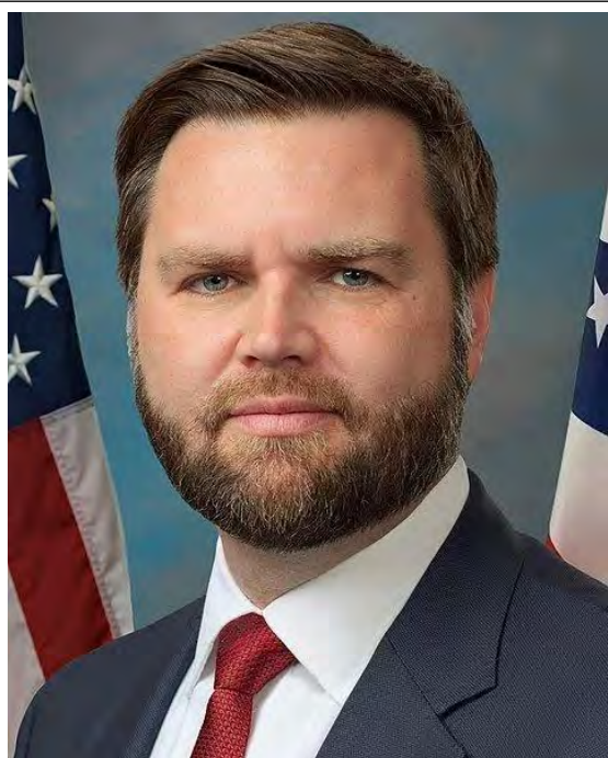
Senator Vance official portrait. 118th Congress, Jan. 26, 2023

President Kamala Harris, who, days earlier, had dismissed a Christian student declaring, "Jesus is Lord," by saying, "You're at the wrong rally."