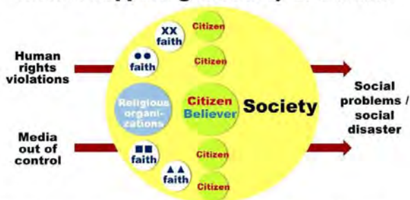
English reconstruction of one of the slides Fumihiko Kato used 20th Jan. 2024. Illustration: FFWPU

discrimination and exclusion against believers have occurred due to information running wild, then this can be said to be a press disaster and an information disaster . An information disaster is a concept that attracted attention through studies of the rumors and damage that occurred in the aftermath of the 2011 nuclear accident, and questioning the causal relationship between rumors causing harm and the resulting damage . Natural disasters are caused by nature itself. Information disasters are caused by information. And it is the media that widely disseminates information to the public .