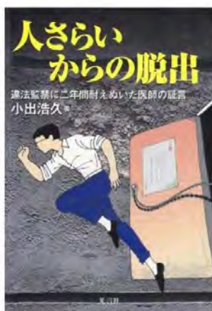
From the front cover of the