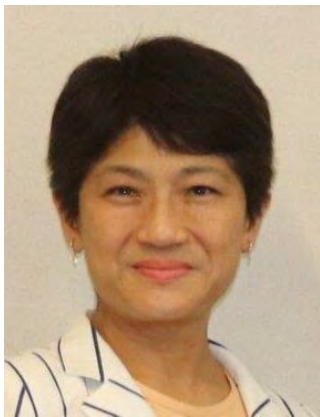
Chinami Nishimura from the Constitutional Democracy Party (CDP), Sept. 11, 2023

They were aware that Koide had been abducted and confined. However, the article published in the 16th September 1993 issue of the magazine made no mention of the abduction or confinement.