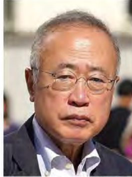
Yoshifu Arita (有田芳生) giving a speech on the street in front of Hachioji Station in Tokyo 14th October 2024.