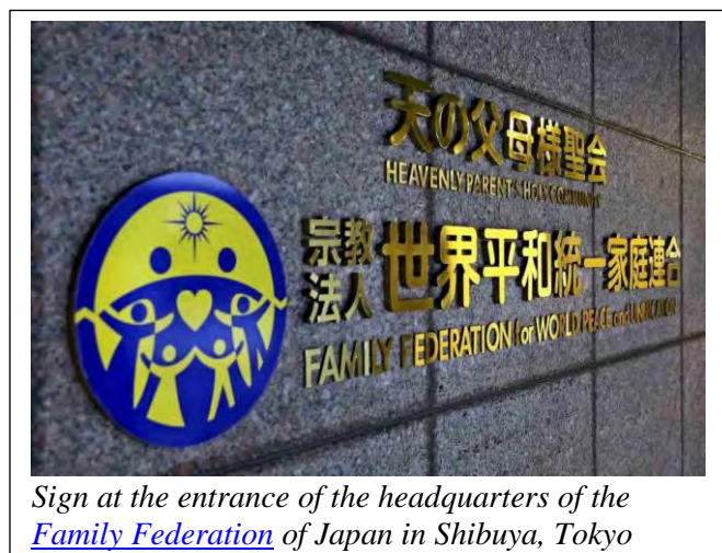
Sign at the entrance of the headquarters of the Family Federation of Japan in Shibuya, Tokyo

See part 7: Religion in Japan in a Global Context: 47th article , 48th article , 49th article , 50th article , 51st article , 52nd article , 53rd article , 54th article