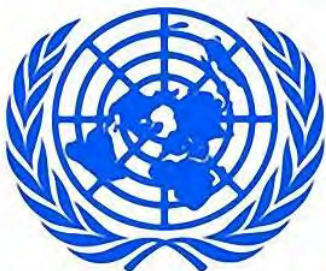
International Covenant on Civil and Political Rights

The report also criticized "anti-cult" counseling in schools, describing it as a new form of "state-led deprogramming" that doesn't involve physical abduction but still violates the rights of religious "second-generation" individuals. Such measures were condemned for infringing on parents' rights to educate their children based on their faith, as guaranteed under human rights covenants.