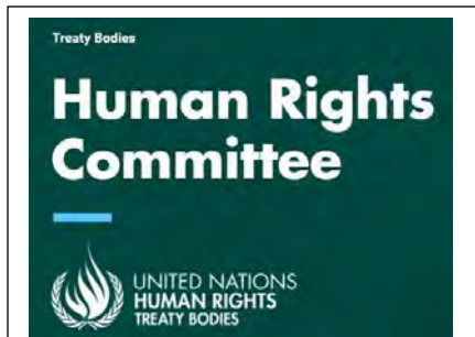
From header of the webpage of the Human Rights Committee, a subpage on the site of the UN Human Rights Office of the High Commissioner

The Human Rights Committee, which oversees the implementation of the International Covenant on Civil and Political Rights (ICCPR), has called on the Japanese government to make amends, claiming that it has "unlawfully restricted the right to freedom of religion or belief on the basis of the 'public welfare'." In its recommendations, the committee expressed concern that the "concept of 'public welfare' is vague and open-ended" and that it "may allow for restrictions that go beyond what is permissible."