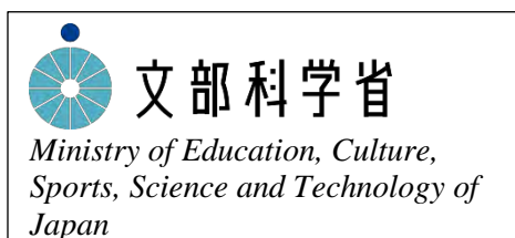
Ministry of Education, Culture, Sports, Science and Technology of Japan

Considering the series of actions taken by the government, one cannot shake the impression that this is a state-led project aimed at eradicating a specific religious organization . Some media outlets have reported on the closed-door hearings at the Tokyo District Court regarding the Ministry of Education, Culture, Sports, Science, and Technology's (MEXT) request for a dissolution order against the Family Federation for World Peace and Unification . During witness examinations involving former and current believers, current members reportedly argued that "the claims made by former members contain falsehoods."