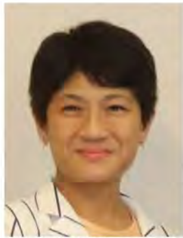
Chinami Nishimura from the Constitutional Democracy Party (CDP), 11th Sept. 2023.

They were aware that Koide had been abducted and confined. However, the article published in the 16 th September 1993 issue of the magazine made no mention of the abduction or confinement.