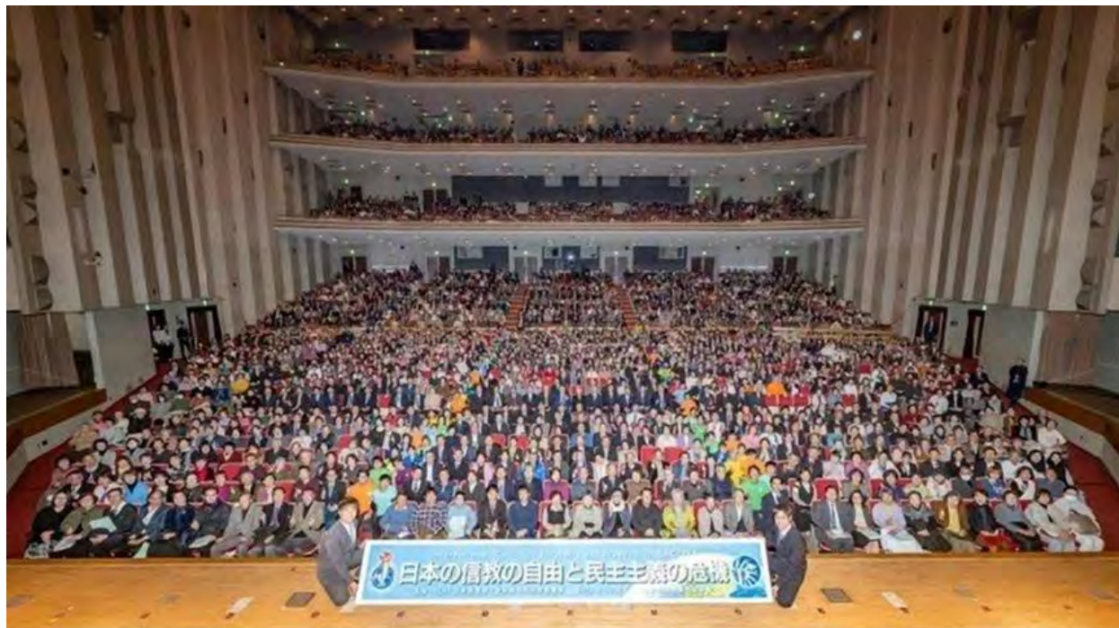
Participants in an event organized by the International Coalition for Religious Freedom (ICRF) Japan Committee at Niterra Civic Hall in Nagoya, on December 9, 2024