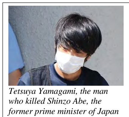
Tetsuya Yamagami, the man who killed Shinzo Abe, the former prime minister of Japan

This hostility invoked the populist but unscientific label of "cult" and focused on alleged practices such as high-pressure donation solicitations and insufficient education for second-generation members. Critics revived claims about "spiritual sales" from decades past, though such sales had mostly ceased. Media and political narratives amplified the grievances of individuals reporting negative experiences while ignoring the many second-generation members who thrived within these faiths.