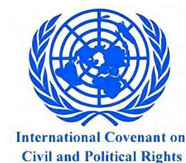
International Covenant on Civil and Political Rights

The implications of these measures extend beyond the Family Federation to threaten all religious groups. Labels such as "controversial" or "anti-social" lack clear definitions, enabling opponents to target minority religions arbitrarily. Concerns about donations often rely on discredited theories of "brainwashing" and "mental manipulation", dismissed by Western scholars for decades. The new guidelines risk curbing the ability of conservative religions to socialize children with values differing from societal norms.