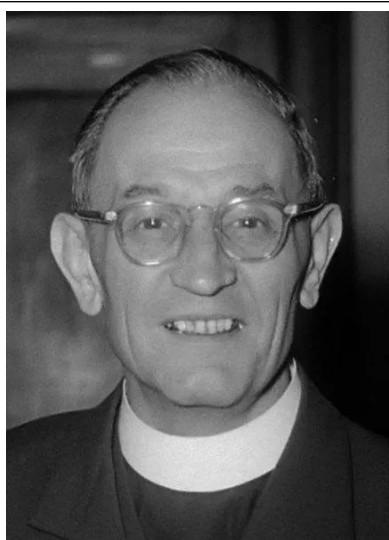
Dr. Martin Niemöller 27th May 1952