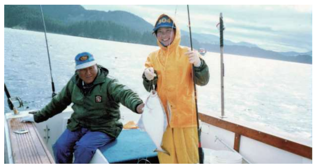
The "tiny, tiny halibut" that made this personal photograph with True Father possible

"True Father is coming to Pac Pearl right now to check the plant." True Father had already come to see Pac Pearl from corner to corner. Why was he coming in the middle of the night when the plant was not operating? I understood immediately that he had caught my thinking, How excited and happy he would be if he were to see so many halibut on the floor. True Parents know even the corners of our minds.