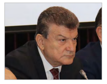
The first session was moderated by Hon. Gaqo Apostoli , former Minister of Transport and current chairman of UPF in Albania.

The presence of former Balkan heads of state and the gathering of Albanian parliamentarians from both ruling and opposition parties, at a time of enduring conflict in the Albanian Parliament, raised the interest of the local media which covered live the whole event.