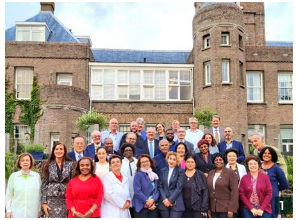
1 Participants of the UPF Vision and Peace Principles seminar at Glory House in Bergen aan Zee, Netherlands

Bergen aan Zee, Netherlands —The third seminar on the UPF Vision and Peace Principles drew 40 participants from 10 nations. The seminar was held from September 6 to 8, 2019, at Glory House, a beautiful estate located on the shores of the North Sea. The program featured an introduction to the life and philosophy of UPF founders Father and Mother Moon and to the recent developments of UPF activities throughout the world. Participants came from Belgium, Bulgaria, Egypt, Germany, Hungary, Kosovo, Lebanon, Moldova, the United Kingdom and Netherlands and represented different faiths and cultures.