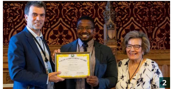
1 The event took place in Committee Room 10 at the Houses of Parliament.