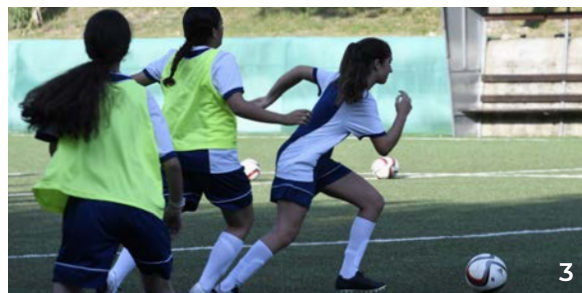
1 The Israeli girls and their teachers together with San Marino dignitaries and UPF officials in the San Marino Parliament