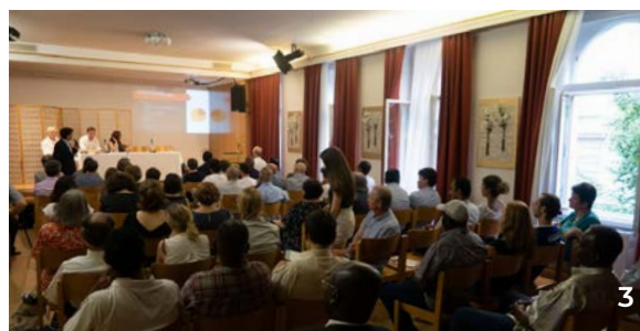
3 The event was held on June 25, 2019, in the UPF Peace Embassy in Vienna.