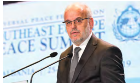
Hon. Talat Xhaferi, Chairman of the National Assembly, North Macedonia

Hon. Albin Kurti, whose party recently had won the elections in Kosovo and who was expected to form the next government, referred to the ongoing struggle between his nation and Serbia. A recurring danger, he said, is for people to emphasize what divides instead of what unites. Acknowledging that the commitment to peace is what spurs progress for all, he commended the summit for bringing like-minded people together.