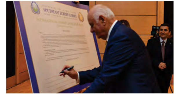
H.E. Alfred Moisiu, President of Albania (2002–2007), signing the ISCP Declaration