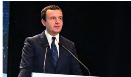
Hon. Albin Kurti, Member of Parliament, Kosovo