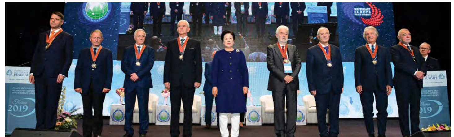
Eight former heads of state received an ISCP founding medal from Dr. Moon: (L to R) Prime Minister Bajram Kosumi of Kosovo (2005–2006); Prime Minister Vilson Ahmeti of Albania (1991–1992); Acting President Jakup Krasniqi of Kosovo (2010–2011); President Živko Budimir of Bosnia-Herzegovina (2011–2015); Dr. Moon; Prime Minister Mirko Cvetković of Serbia (2008–2012); President Fatmir Sejdiu of Kosovo (2006–2010); Prime Minister Hasan Muratović of Bosnia-Herzegovina (1992–1995); and President Stjepan Mesić of Croatia (2000–2010)

Dr. Moon said that she envisioned a bright future for Albania and the Balkans, pointing to the historical role of peninsulas as cradles of civilization. Albania may have been considered the last in Europe after a long history of suffering, she said, but the time had come “for the last to become the first”. She concluded the session by bestowing ISCP founding medals to eight former heads of state and government from Balkan nations.