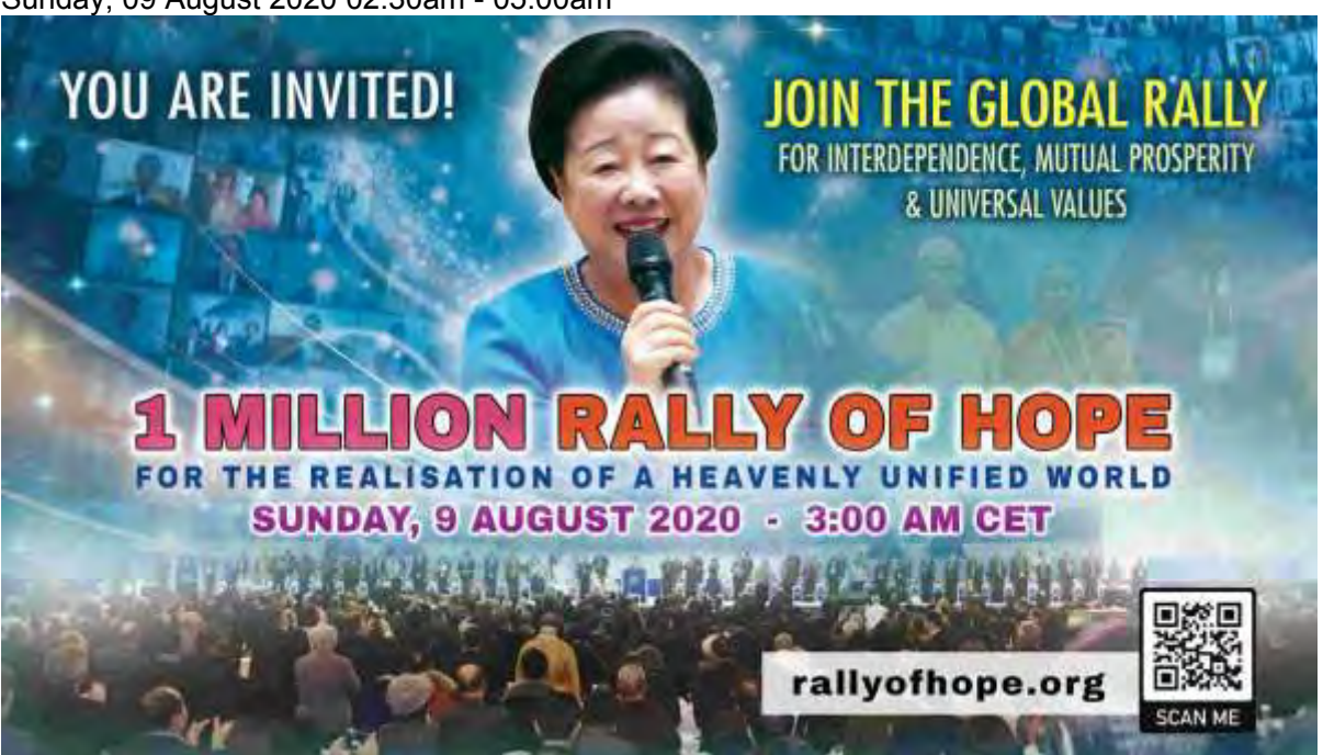
Click here to join the event.

Sunday, 09 August 2020 02:30am - 05:00am