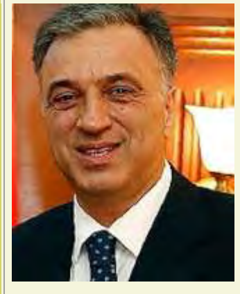
"Partnership for Peace".