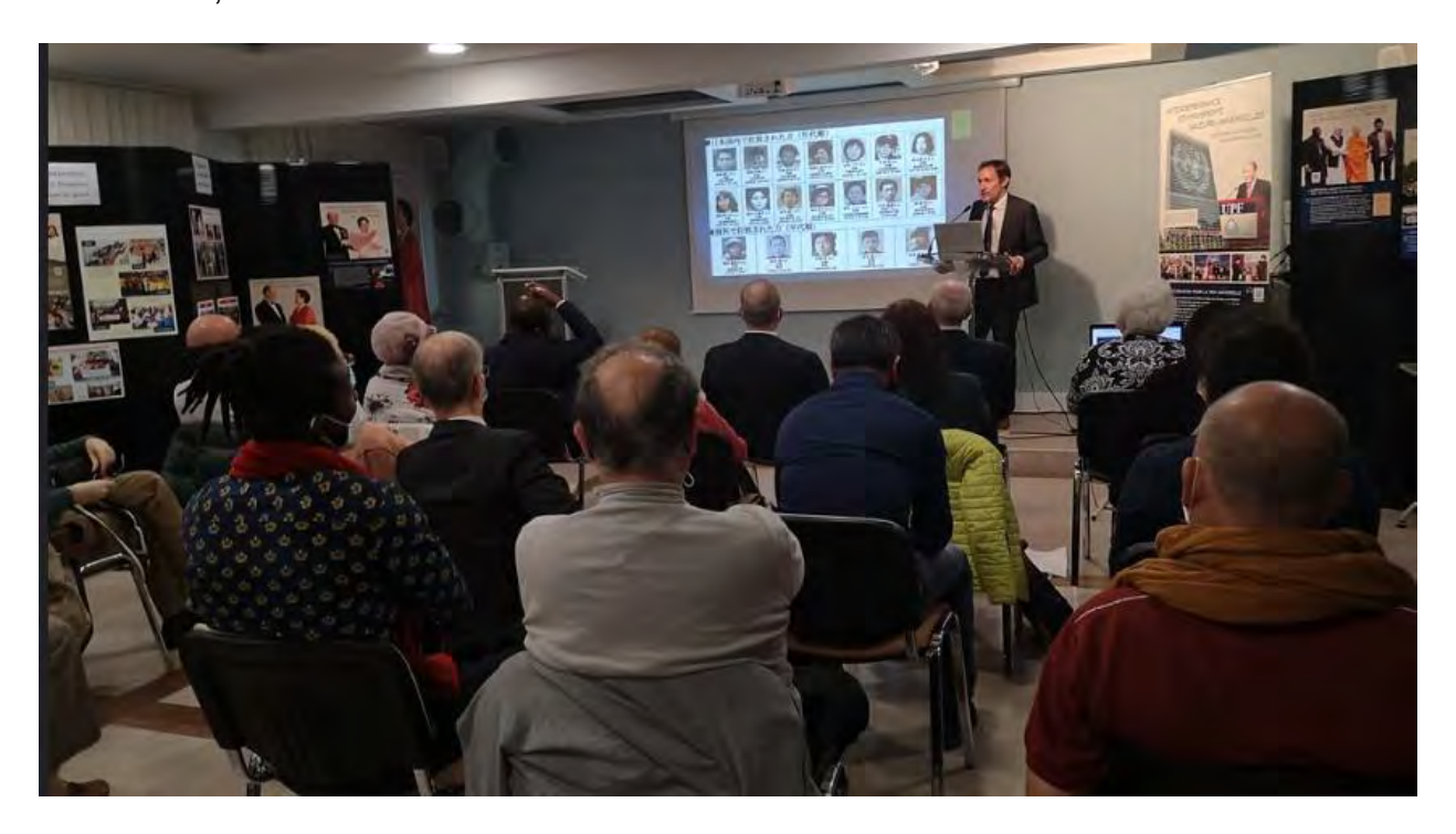
Paris, France -- On the occasion of the UPF Founders Centenary Exhibition, UPF-France organized a forum on prospects for peace in Africa and Korea.

In order to respect the sanitary conditions imposed by the pandemic, about 20 participants attended the October 24, 2020, event at the Espace Barrault education center of UPF, while others followed the program online.