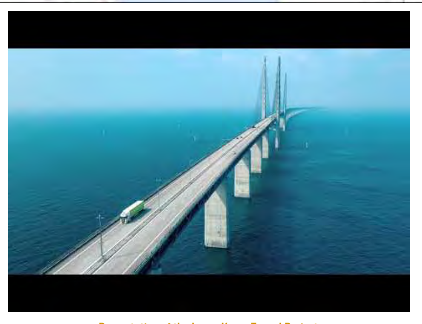
Presentation of the Japan-Korea Tunnel Project.