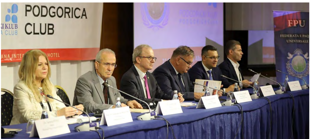
The panelists of the second session

Hon. Muamer Bacevac, a member of Parliament in Serbia, emphasized the importance of overcoming prejudice, which gives birth to anger and conflict. Prejudice can be replaced with tolerance, which is the respect and appreciation of all people despite differences in speech, values, culture, and other domains, he said. Practicing tolerance can allow understanding and solidarity. He ended his speech with a message of hope that after the pandemic, a new golden era for care and cooperation will begin.