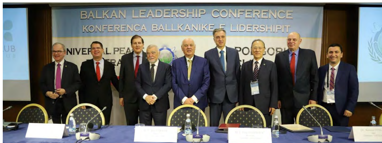
The panelists of the first session with UPF leaders

The panel discussion ended with congratulatory remarks from two former Balkan leaders.