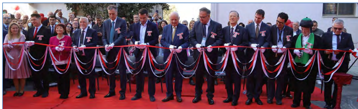
The Ribbon Cutting Ceremony

Approximately 300 people attended the inauguration, which was widely covered by the region's newspapers, television, and social media.