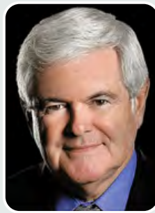
Speaker Newt Gingrich

US Coordinator, International Association of Academicians for Peace (IAAP) (Host)