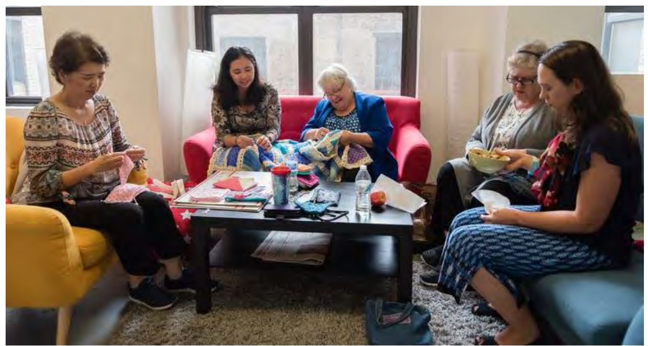
Ladies crocheting or knitting during their lunch break to create blankets of love.

In 2021 Women's Federation for World Peace adopted a wonderful project, "Strings of the Heart" to give handmade blankets to people who have suffered a loss or who need comfort or inspiration. They are "blankets of love."