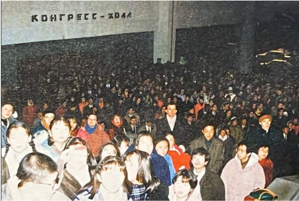
Members waiting outside the hotel where True Parents stayed