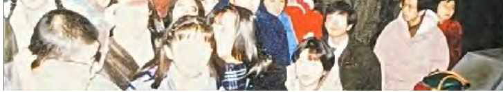
Members waiting outside the hotel where True Parents stayed