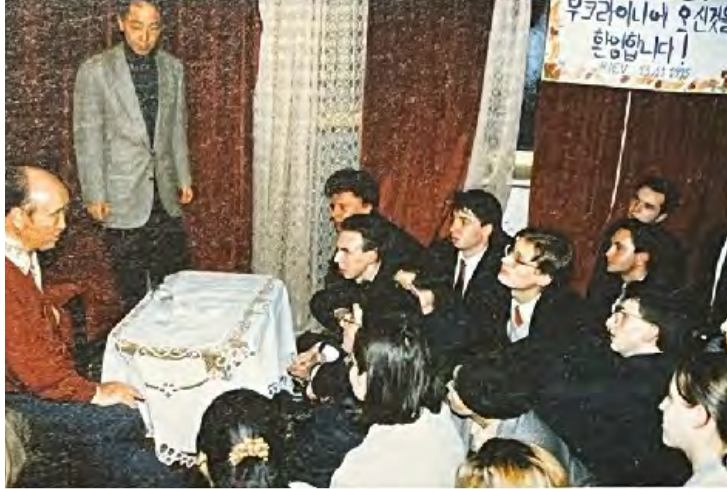
True Father speaks to members in Kiev, November 14, 1995