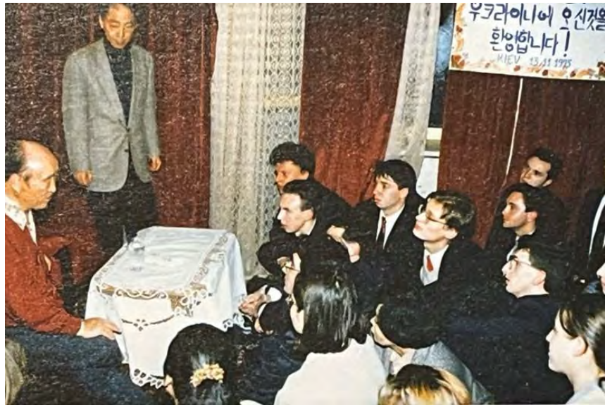
True Father speaks to members in Kiev, November 14, 1995