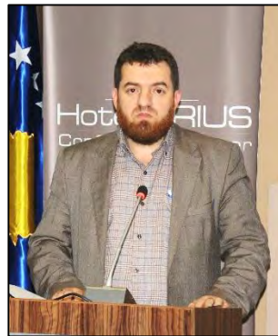
Imam Rexhep Lushta