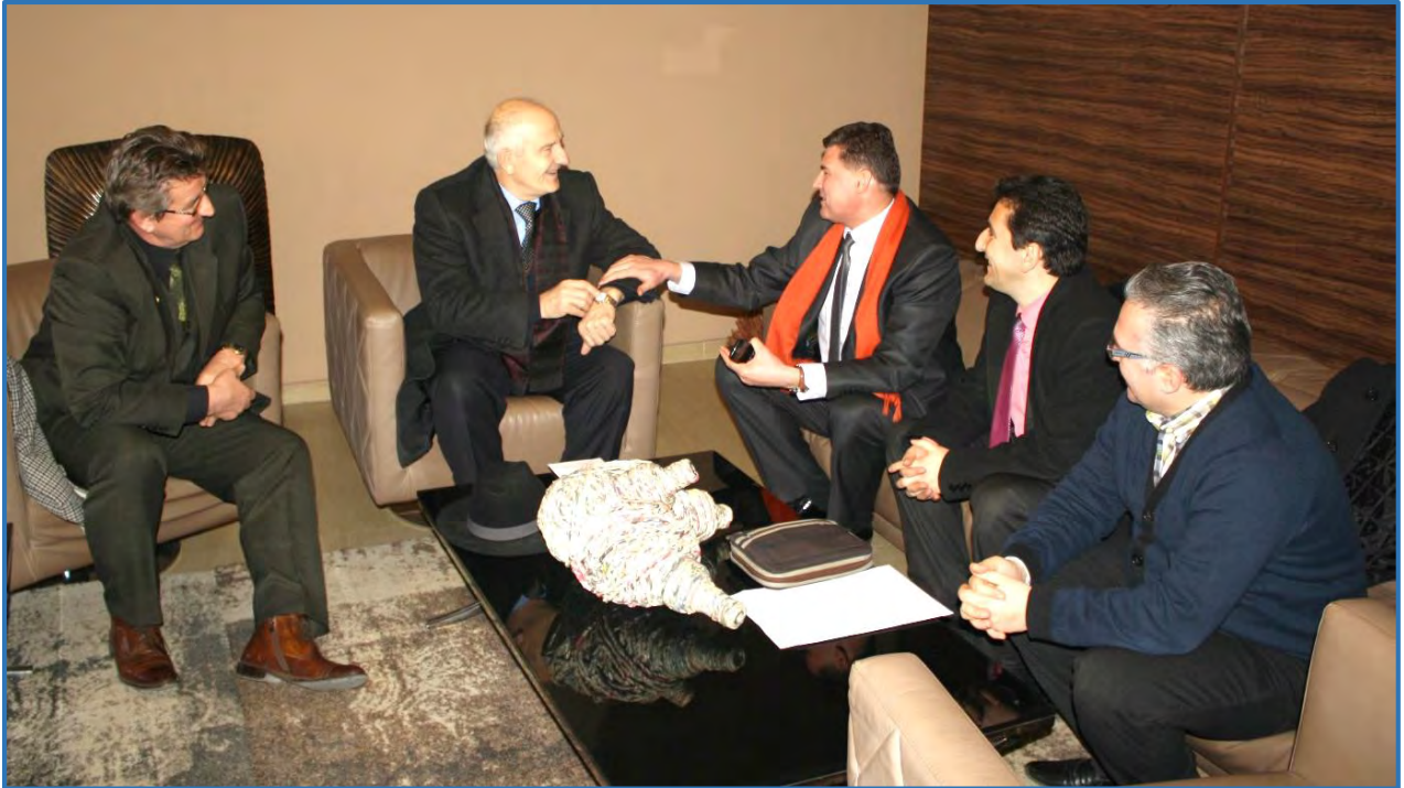
Former president Fatmir Sejdiu welcomes the delegation of UPF Albania to Kosova