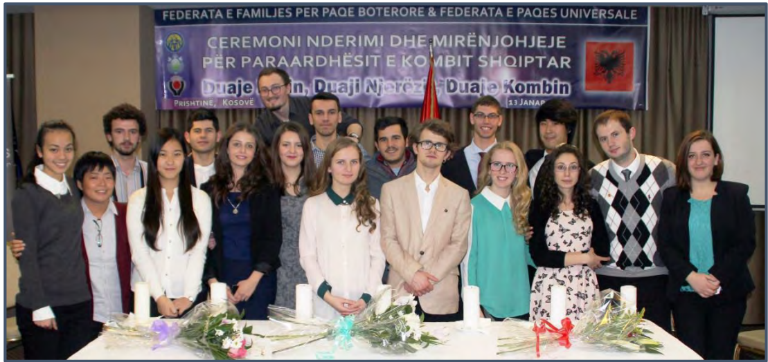
The volunteers from FFWPU Kosova and STF Europe that worked hard for the event