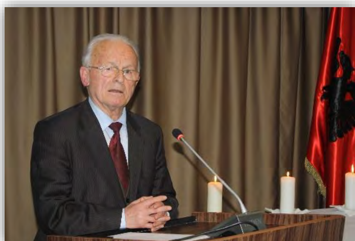
Mr. Adem Demaçi