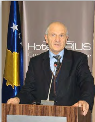
H.E. Fatmir Sejdiu