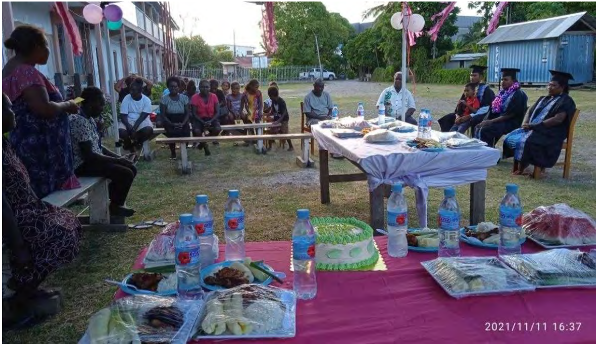
Graduation Celebration with staff and friends at the New Hope Academy School