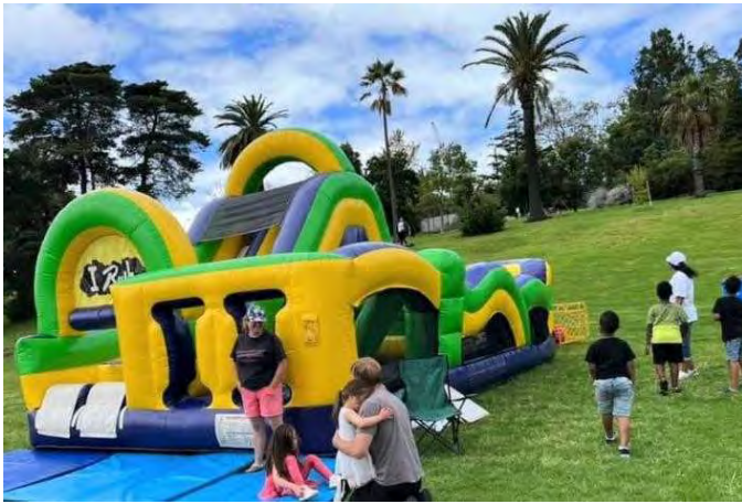
Families appreciated the Children's activities