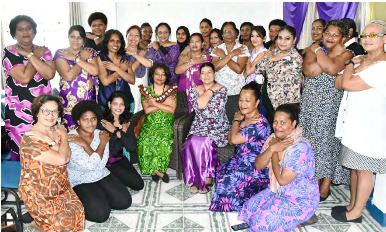
Participants Embracing Equity

Thirty participants attended representing the Fiji Police Force, Indian High Commission (Womens Wing), National Women's Club, corporate businesses, housewives, and tertiary institutions.