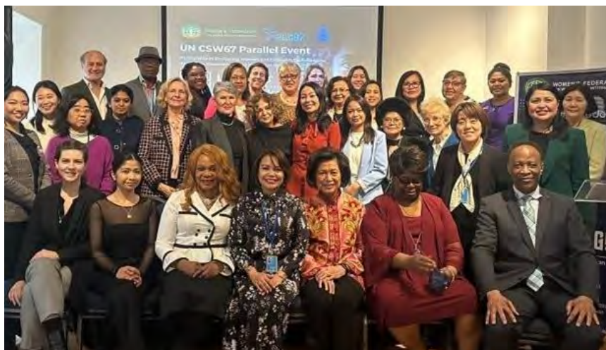
Participants at the WFWPI Parallel Event

Our work is about building relationships, connecting with people, and speaking in public forums. Therefore, it is very important that we learn to speak professionally, and precisely. Be articulate and constructive with your speech. Grab the attention of your audience and create an impact.