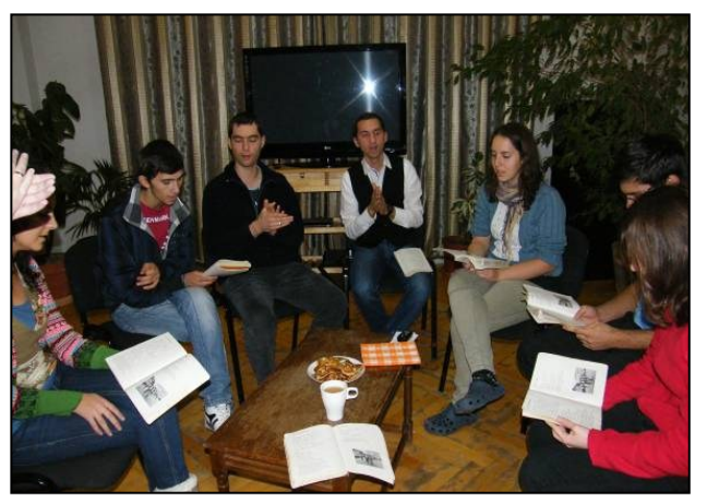
Sharing of Heart