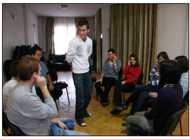
Hwa-dong Hae (Unity and harmony day)