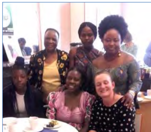
Guests in the Cafe