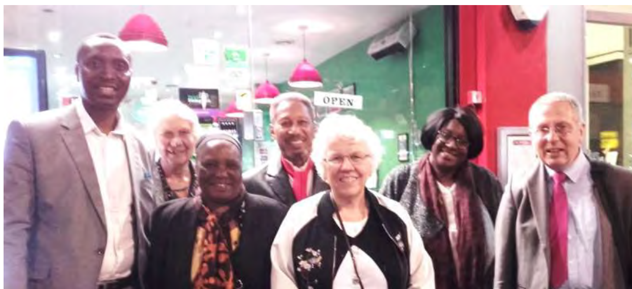
ABC volunteers and ministers at dinner afterwards to share and reflect