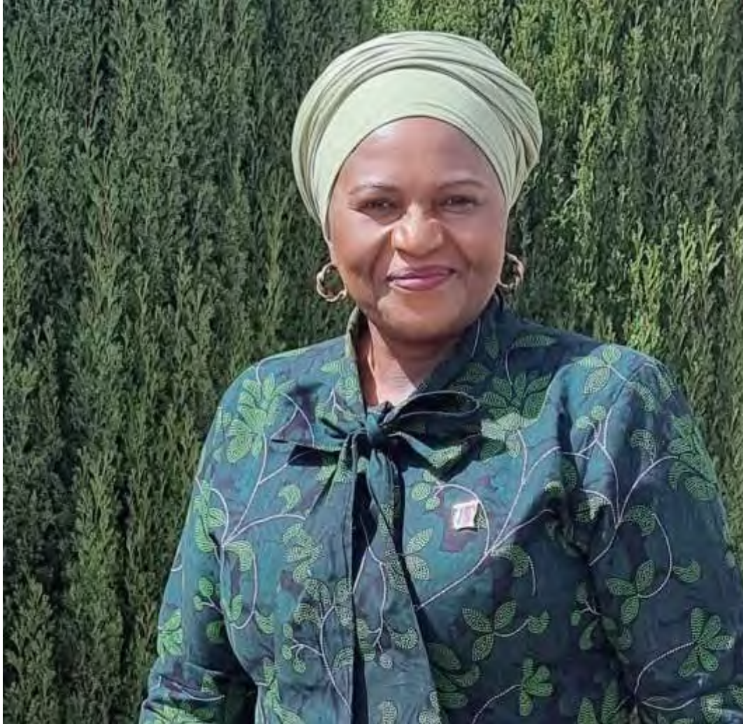
H.E. Ambassador Dr. Calista Mutharika , Chairperson, IAFLP Africa Former First Lady of Malawi · Cabinet Minister · Member of the Pan-African Parliament · Malawi High Commissioner to Kenya · Founder: Safe Motherhood Foundation & Dignity Adolescent Girls