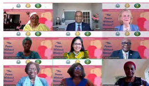
AFRICAN FIRST LADIES ASSOCIATION COMMIT...