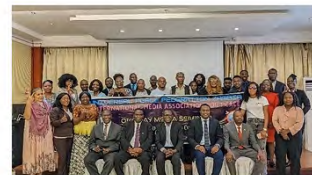
IMAP-ZAMBIA SEMINAR STRIVES FOR...

If you find this page helpful and informative please consider making a donation. Your donation will help Universal Peace Federation (UPF) provide new and improved reports, analysis and publications to you and everyone around the world.