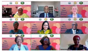
AFRICAN FIRST LADIES ASSOCIATION COMMIT...