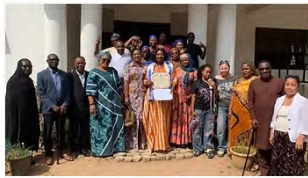
NIGERIAN SEMINAR UPHOLDS VALUE AND...