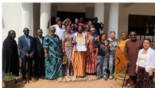
NIGERIAN SEMINAR UPHOLDS VALUE AND...