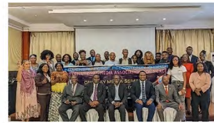
IMAP-ZAMBIA SEMINAR STRIVES FOR...

If you find this page helpful and informative please consider making a donation. Your donation will help Universal Peace Federation (UPF) provide new and improved reports, analysis and publications to you and everyone around the world. UPF is a 501(c)(3) tax exempt organization and all donations are tax deductible in the United States. Receipts are automatically provided for donations of or above $250.00.